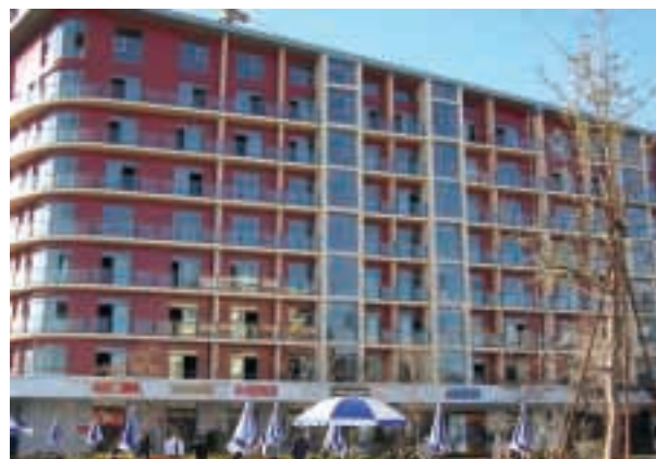
Beijing Silo City