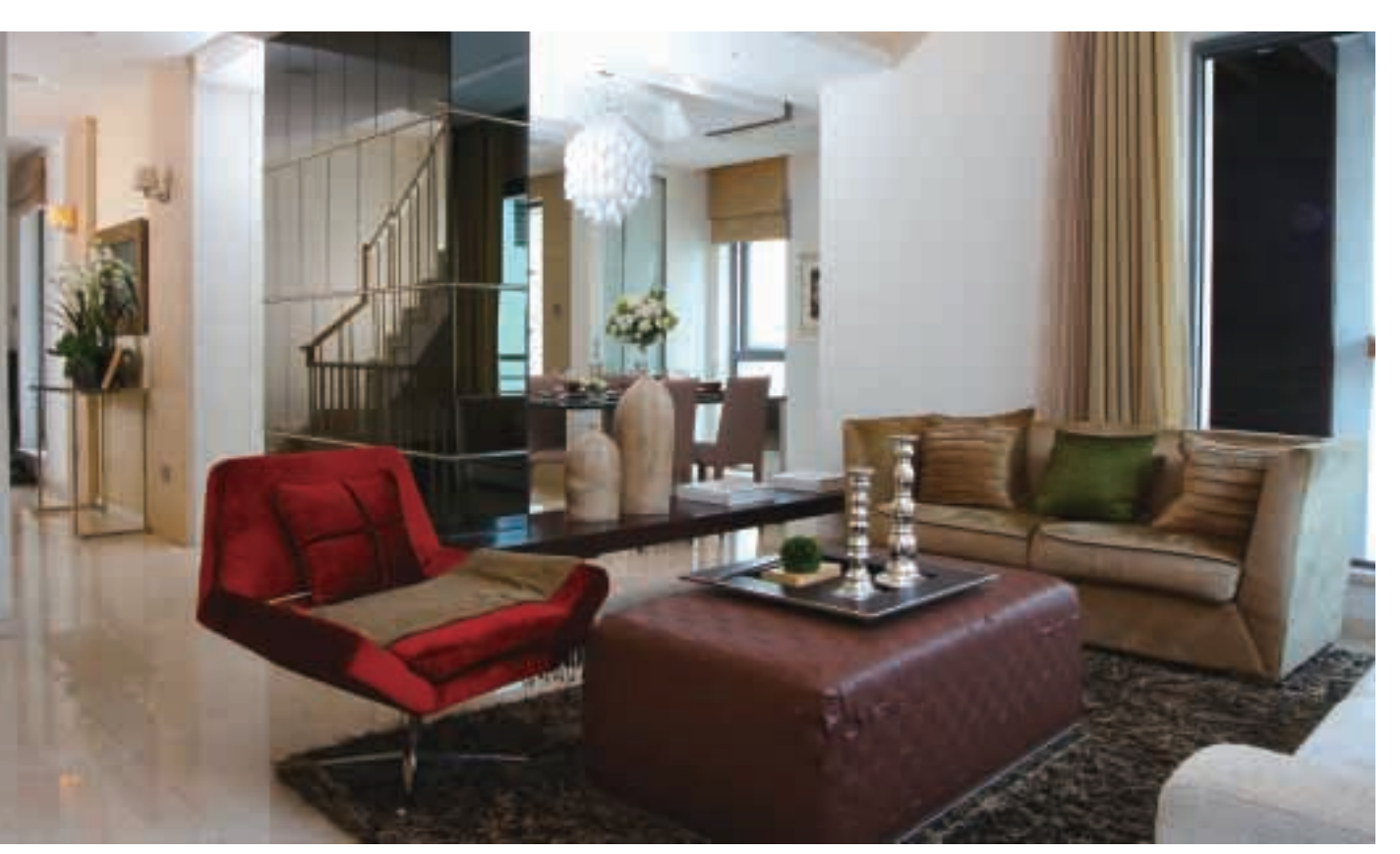
Show flat of Shanghai Riviera Garden

Various macro economic control measures implemented by the Chinese government including tight credit policy and restrictions in relation to property development orientation, taxation, financing and land supply etc, specific to the real estate sector are expected to cool down the PRC property market in the near term and in the long run bring stability and sustainability to the real estate sector. With more stringent requirements and financial demands imposed on property developers, smaller developers will become less competitive in the marketplace and more opportunities will be available to larger developers with more resources. The Group believes it is well positioned to take on new challenges and capture the new opportunities with its prudent growth strategy and with the support of its experienced and qualified management team, well-recognised corporate brand, strong internal and external financial sources accessible in the domestic and overseas capital markets, and its geographically well diversified quality development and investment property portfolio on hand.