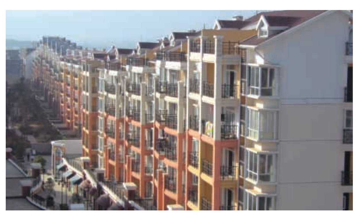
Jiangxi Riviera Garden

The Group is engaged in residential property development business as well as in the business of investing in quality commercial properties, including hotels and offices, at prime locations in major cities in the PRC. The Group plans to build up an investment property portfolio that will account for about 30% of its overall property portfolio in the next three to five years so as to enable the Group to generate more stable recurring income and capture the potential value appreciation of property.