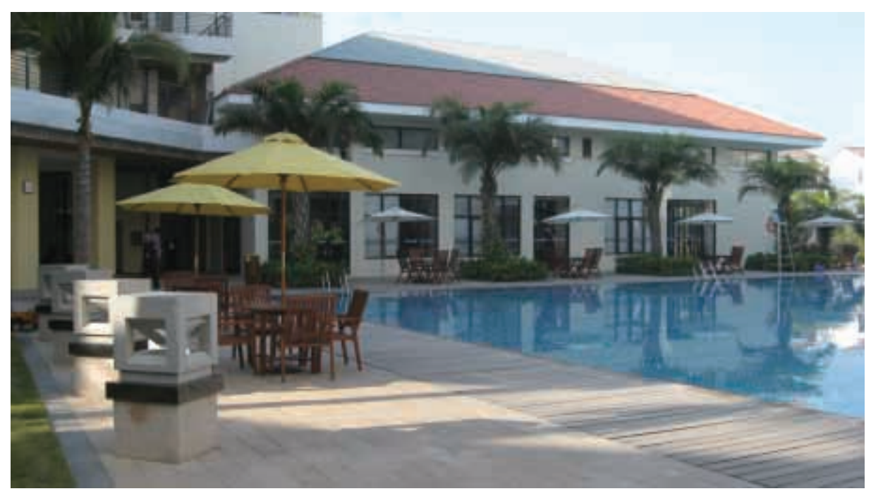
Dongguan Riviera Villa