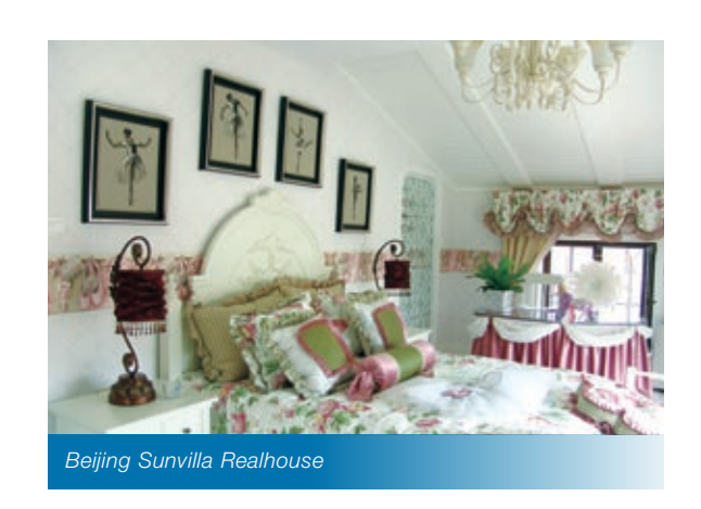
COASTAL GREENLAND LIMITED

At 31 March 2011, the Company had outstanding 111,622,500 unlisted warrants conferring rights to subscribe for up to 111,622,500 new ordinary shares of HK$0.10 each in the Company at the adjusted exercise price of HK$1.23 per share (subject to adjustments) at any time on or before 8 November 2012. These warrants are classified as derivative financial liabilities which are measured at fair value with movement recognised in profit or loss. The fair value gain on warrants arose as a result of the decrease in the share price of the Company during the year.