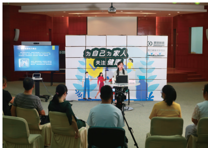
During the Reporting Period, the Group launched the "Occupational Health Expert" activity 本集團於報告期間內開展了「職業健康達人」活動