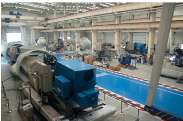
南通安迅生產車間 Production workshop of Nantong Acciona

The three joint venture parties underwent several discussions on handling the issues of accelerating the speed of localisation of supply of components and procuring sales by lowering selling price, but with no solutions thereof derived. Currently, the three joint venture parties are continuing discussions. The Group has consideration of selling of its equity in effort to reduce loss.