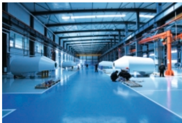
內蒙古風機總裝廠 — 車間

Inner Mongolia Windmill General Assembly Plant – Assembling