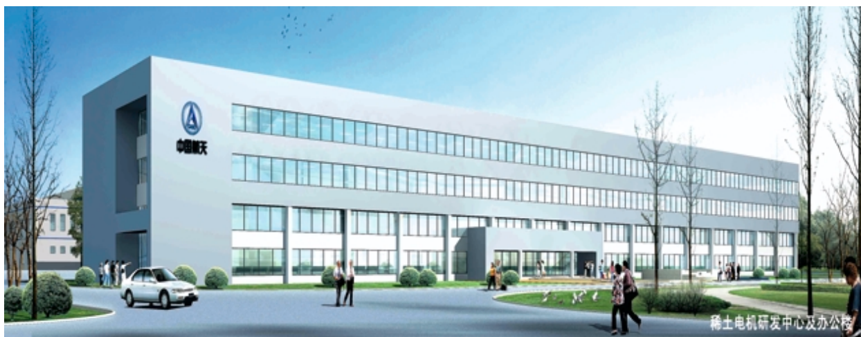
稀土電機研發中心 Rare-earth permanent magnetic motor research centre

Jiangsu REPM (formerly Hangzhou REPM) became the Group's subsidiary on 1 July 2008 when the Group took effective control thereon in wake of entering into an equity assignment contract with Shanghai STEP Electric