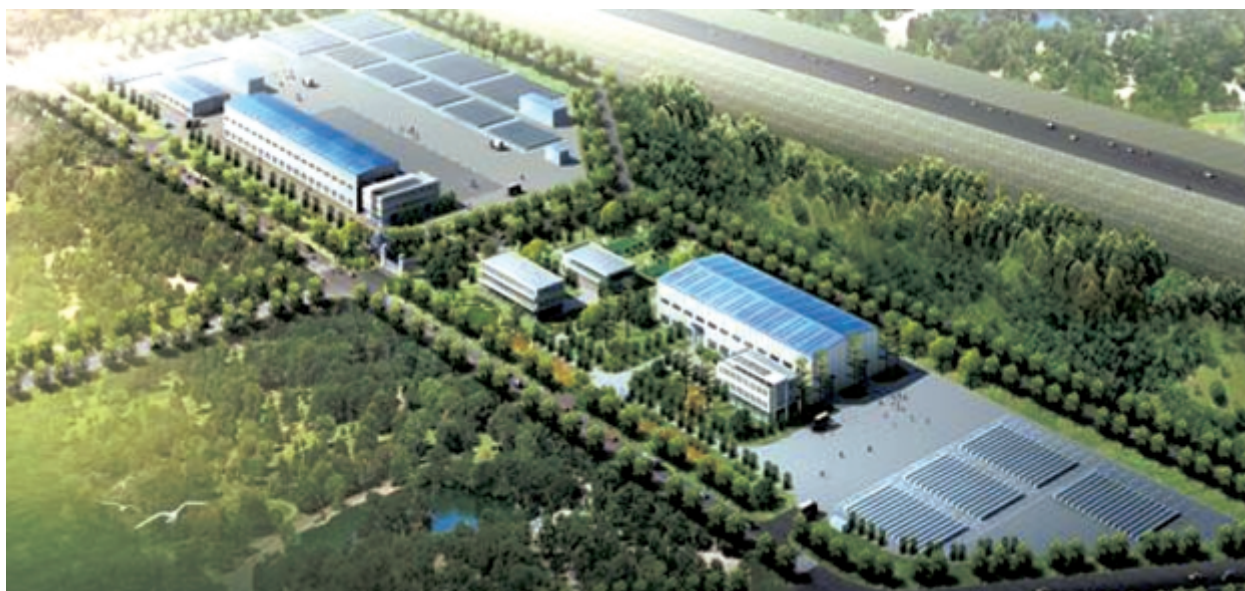
內蒙古風電產業園全貌 Full view of Inner Mongolia Windmill Property Park

Inner Mongolia CASC Energiner New Energy Development Co. Ltd., the wholly-owned subsidiary of the Group, engaged in development of Inner Mongolia windmill property park, has commenced the construction works of plants, offices, warehouses of direct-drive windmill composite material plant and direct-drive windmill turbine plant regarding the said park in relation to rendering of the property management service to IM Turbine Manufacture and IM Composite Material.