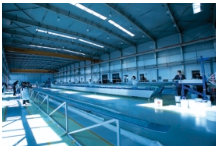
內蒙古風機葉片廠 — 車間

Inner Mongolia CASC Energin Composite Material Co. Ltd. ("IM Composite Material") is a joint venture between the Group (BEI's 35% and New Image Development Ltd.'s 20%), Aerospace Material and EWT with shareholding of 55%, 40%, and 5% respectively, engaged in the businesses of production of tailored-made blades for IM Turbine Manufacture and other windmill manufacturers and of undergoing research and developments and quality recognition of blades with the technology research and development center under the joint venture agreement of 1 December 2008. It was planned that the capacity of the annual production of the plant with area of about 180 hectares to be established in one of the richest wind resources territories (adjacent to windmill general assembly plant), in Xinghe County, Wulanchabu City, Inner Mongolia by the company will reach 400 sets of 900KW direct-drive windmill blades and 250 sets of 2MW direct-drive windmill blades. The registered capital and total investment of this company amount to RMB80 million and RMB100 million respectively. The Group's share of capital contribution amounts to RMB44 million.