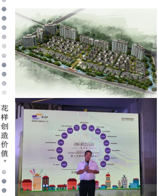
The Launch of Caizhiyun 3.3

(5 July 2016 - Hong Kong) Fantasia Holdings Group Co., Limited ("Fantasia" or the "Company", which together with its subsidiaries, is referred to as the "Group"; HKEx stock code: 1777) announces that the Group's smart community platform "Caizhiyun 3.3 version" was officially launched on 30 June 30 2016. Based on the original community service platform, this 3.3 version has accomplished a comprehensive upgrade that brings most products online, presents "Colour Life Property" projects better, establishes micro business communities construction and enhances functionalities of products such as "Colour Wealth Life" (Cai Fu Ren Sheng).