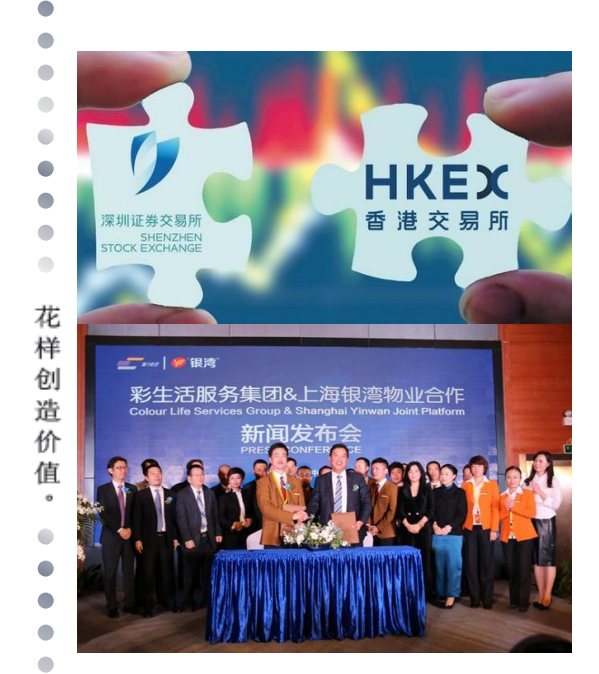
Colour Life Services Group & Shanghai Yinwan Joint Platform Press Conference

(5 December 2016 – Hong Kong) Fantasia Holdings Group Co., Limited ( "Fantasia" or the "Company", which together with its subsidiaries, is referred to as the "Group"; HKEx stock code: 1777) announces its sales performance for November 2016. Fantasia Property Group, a subsidiary of the Group, achieved contracted sales of approximately RMB751 million, with 81,231 sq.m. in aggregated gross floor area ( "GFA" ) sold for the month of November.