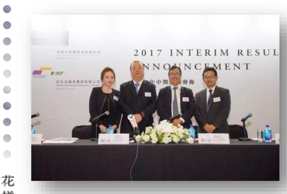
2017 Interim Results Announcement

(5 September 2017 - Hong Kong) Fantasia Holdings Group Co., Limited ("Fantasia" or the "Company", which together with subsidiaries, is referred to as the "Group", HKEx stock code: 1777) announces its performance for August 2017. Fantasia Property sold 价 Group, a subsidiary of the Group, properties with an aggregate of 89,046 square metres (sq.m.) in gross floor area ("GFA") and recorded contracted sales of RMB148 million in the month. From January to August 2017, Fantasia Property Group sold properties with an aggregate of 824,202 sq.m. in GFA. The accumulated contracted sales reached RMB7,238 million. For the first seven months of the year, the Group completed 48.3% of its full-year contracted sales target of RMB15.0 billion.