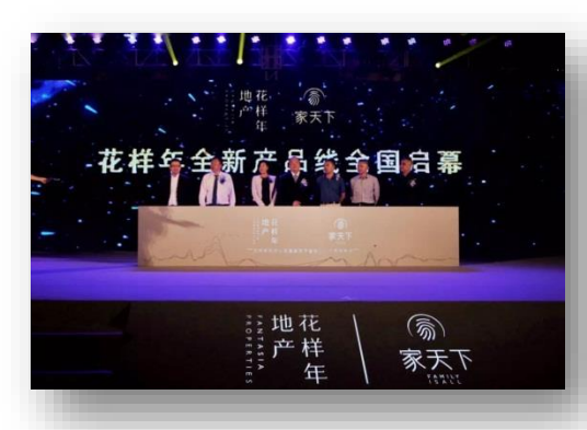
"Jiatianxia" officially launched