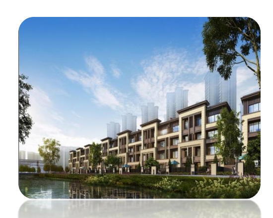
Chengdu • Xiang Men Di

(4 May, 2018 – Hong Kong) Fantasia Holdings Group Co., Limited ("Fantasia" or the Company", which together with its subsidiaries, is referred to as the "Group", HKEx stock code: 1777) announces its sales performance for April 2018. Fantasia Property Group, a subsidiary of the Group, sold properties with an aggregate of 197,564 square metres (sq.m.) in gross floor area ("GFA") and recorded contracted sales of RMB1.798 billion, which represented a significant year on year growth of 120.51%. For the first four months of 2018, the Group sold properties with an aggregate of 664,506 sq.m. in GFA. The accumulated contracted sales during the period grew by 74.88% year on year to RMB6.343 billion, which means accomplishment of 21.14% of the full-year contracted sales target of RMB30 billion.