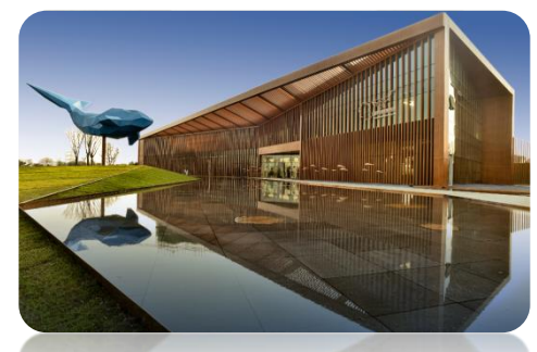
Jiatianxia · Chengdu

(6 August, 2018 – Hong Kong) Fantasia Holdings Group Co., Limited ("Fantasia" or the "Company" which, together with its subsidiaries, is referred to as the "Group", HKEx stock code: 1777) announces its sales performance for July 2018. Fantasia Property Group, a subsidiary of the Group, sold properties with an aggregate of 108,021 square metres (sq.m.) in gross floor area ("GFA") and recorded contracted sales of RMB1.536 billion, which represented a year-on-year growth of 118.63%. For the first seven months of 2018, the Group sold properties with an aggregate of 1,273,205 sq.m. in GFA. The accumulated contracted sales during the period grew by 123.15% year on year to RMB12.843 billion, which means accomplishment of 42.8% of the full-year contracted sales target of RMB30 billion.