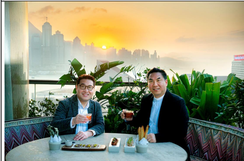
Selected SUPREME customers will receive the membership of New World CLUB and will be able to enjoy the services of Gentry Club, a private club located in K11 MUSEA, through reservation.