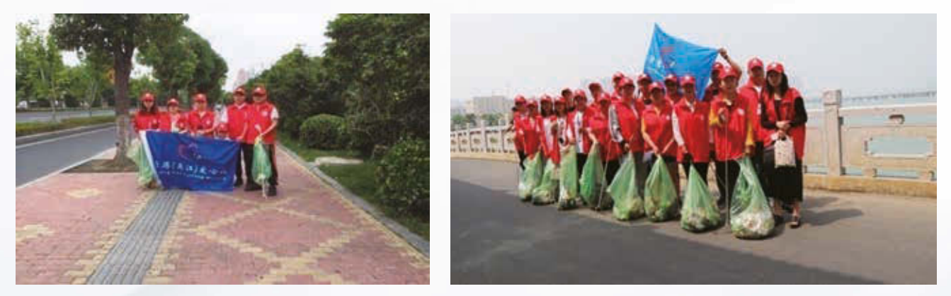
Caring Club environmental activities