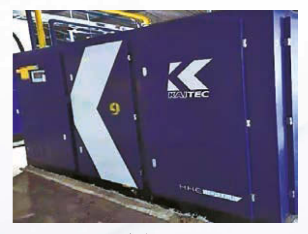
Renovated Air Compressor