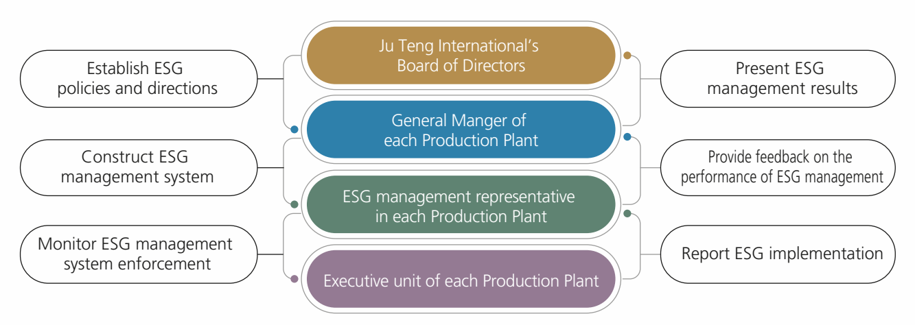
ESG Management Organisation Structure

The Board of Directors of Ju Teng International is taking the lead in formulating ESG management policies at the Group level. The general manager of each production plant company ("Production Plant") is responsible for constructing the ESG management system that meets the characteristics of the Production Plant, participating in the top-level design, controlling the policies and systems of all ESG-related aspects, and reporting to the Board of Directors the Production Plant's ESG management results. Each operational unit in the Production Plants is required to strictly implement the ESG management system, including executing the ESG targets, ESG training, managing ESG-related data and collecting information. The Group's ESG management organisation structure is as follows: