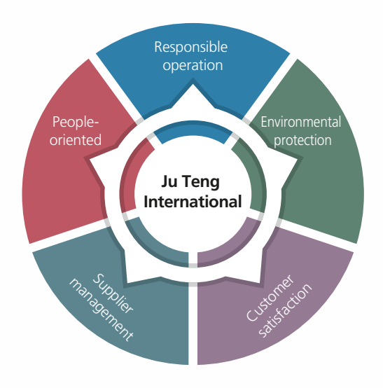
Ju Teng International's visions

Ju Teng International always believes that quality, scientific management and sustainable development are the foundation. With the increasingly stringent requirements of governments and markets on the electronics industry's production chain over the past 22 years, we have won the recognition of our customers worldwide by relying on our advanced technologies, responsible attitude, professional services and excellent product quality. We are well aware that a well-performing enterprise not only delivers high-quality products but also conducts scientific management and achieves sustainable development. With a view to performing the social responsibilities, promoting the progression of our suppliers and protecting the benefits of our broad investors, we promote the sustainable development of the electronics industry through our endeavours in the following five vision areas.