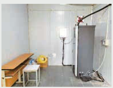
Waste gas emission monitoring station room

reducing the concentration content of pollutants in the discharged painting and spraying waste gas. Meanwhile, the Chongqing Production Plants have built a waste gas emission monitoring station room next to the existing boiler room waste gas emission chimney, and installed additional online monitoring equipment such as flue gas online analyser, dust meter, temperature-pressure-flow integrated machine, etc. to monitor the concentration of pollutants in the boiler emission in real-time, effectively reducing the degree of impact on the atmosphere and the surrounding environment.