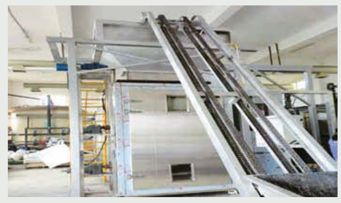
Sludge drying device

New sludge drying devices were provided in the Chongqing Production Plants for the treatment of paint sludge and sludge after the treatment of paint spraying sewage and chemical plastic sewage. The amount of hazardous waste generated from paint sludge and sludge has been significantly reduced after treatment by the sludge drying devices.