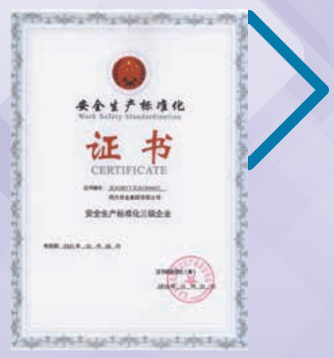
同方藥業獲頒發「安全生產標準化證書」 "Safety Production Standardization Certificate*" awarded to Tongfang Pharmaceutical