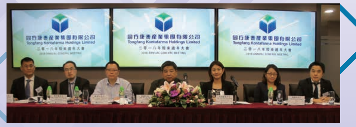
二零一八年股東週年大會 Annual General Meeting in 2018

In 2018, the PRC's healthcare reforms has gradually moved towards the critical stage. At macro level, the PRC government successively adjusted the management structure of the national healthcare sector, establishing the trinity supervision and management system composed of the National Health Commission of the PRC, the National Medical Products Administration and the National Healthcare