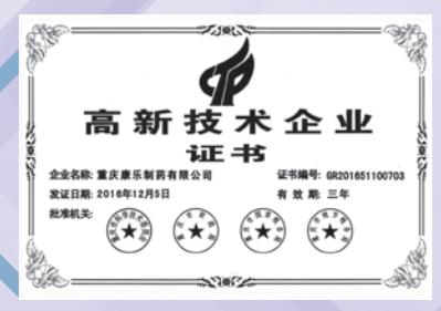
重慶康樂獲頒 「高新技術企業」認證 "Certificate of the High and New Technology Enterprises" awarded to Chongqing Kangle

SPF is principally engaged in the supply of standardized laboratory animals and animal indigenous raw materials. For the year ended 31 December 2018, an operating revenue amounted to RMB43.8 million, representing a growth of 27.0% as compared to RMB34.5 million for 2017. Gross profit for the year ended 31 December 2018 amounted to RMB25.2 million, representing a growth of 70.3% as compared to RMB14.8 million for 2017.