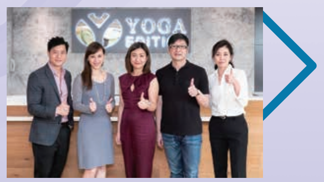
位於台北之精品瑜珈會館品牌「Yoga Edition」開幕 Premium Yoga brand "Yoga Edition" opening in Taipei