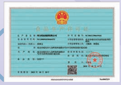
同方藥業取得「食品生產許可證」 "Food Production Licenses" awarded to Tongfang Pharmaceutical

Tongfang Pharmaceutical is principally engaged in the production and sales of chemical generic medicine with over approximately 30,000 square meters of drug production workshops in Yanqing District, Beijing. Its key products are prescription drugs and its therapeutic areas mainly include drugs for local anesthesia and gynecological purposes. For the year ended 31 December 2018, the operating revenue amounted to RMB237.7 million, representing a growth of 45.3% as compared to RMB163.6 million for 2017. Gross profit for the year ended 31 December 2018 amounted to RMB212.7 million, representing a growth of 48.4% as compared to RMB143.3 million for 2017.