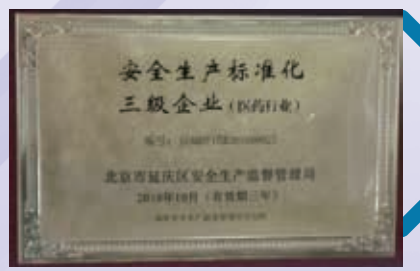
斯貝福獲認定為 「安全生產標準化三級企業」 SPF be recognised as "Safety Production Standardization Level Three Enterprise*"