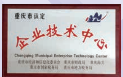
重慶康樂獲認定為 「重慶市企業技術中心」 Chongqing Kangle be recognised as "Chongqing Municipal Enterprise Technology Center"