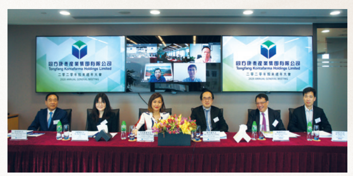
二零二零年 股東週年大會 Annual General Meeting in 2020