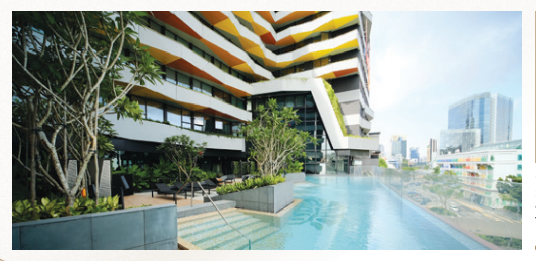
TFX Funan (新加坡) — 游泳 池及休閒甲板TFX Funan (Singapore) — Swimming Pool With Relaxation Deck

On 21 December 2020, the cement business was disposed of and presented as discontinued operation for the year ended 31 December 2020 and the comparatives for the year ended 31 December 2019 have been re-presented accordingly.