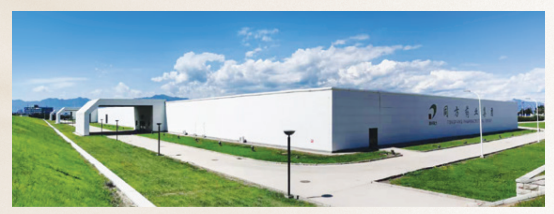
北京中關村延慶園 3.4萬平方米的生產 設施 The 34000 square meters production facilities in Zhongguancun Yanqing Park in Beijing

本集團截至二零二零年十二月三十一日止年 度錄得虧損,而截至二零一九年十二月三十一 日止年度則錄得溢利。有關虧損主要由於因 本集團的健身業務受到COVID-19疫情的嚴重 影響,健身業務商譽減值31.2百萬港元。