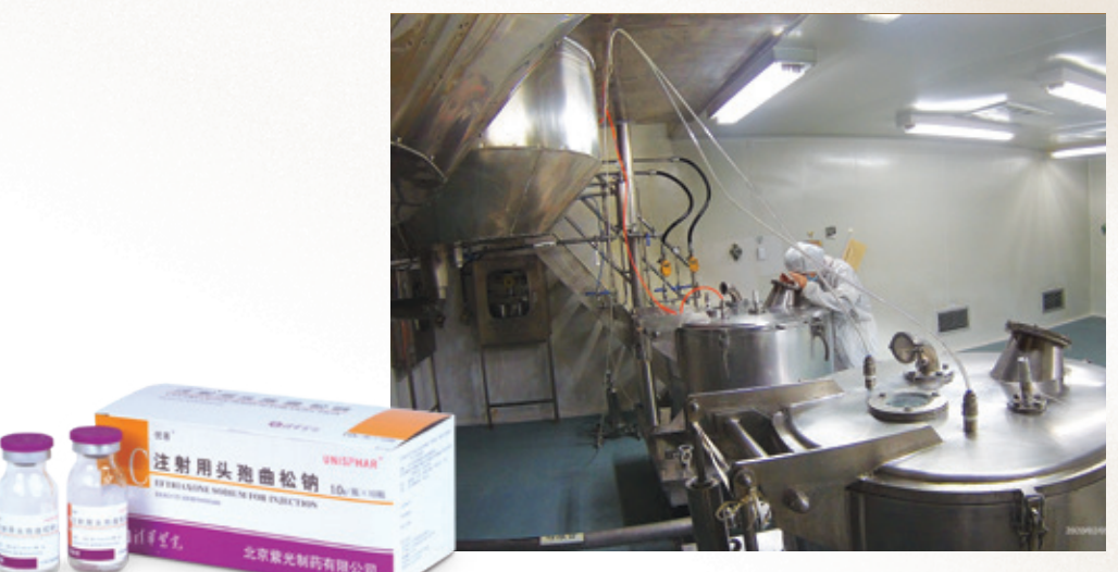
為同方藥業總部的產品做 一致性評價 Provide the consistent evaluation for products from the headquarter of Tongfang Pharmaceutical

Products of Tongfang Pharmaceutical are mainly targeted at hospitals of all levels in China. The COVID-19 pandemic significantly affected the company in the first half of 2020. Its marketing activity encountered extreme difficulties in the toughest months. Having said that, the company managed to coordinate various resources to ensure uninterrupted production and actively reduced expenses and avoided unnecessary spending. Meanwhile, it rapidly adjusted its marketing policies to offset the negative impact of the pandemic. Besides, Tongfang Pharmaceutical actively explored emerging markets. Capitalising on its own advantages, it developed new products such as UCAN probiotic solid beverages and Vigor solid beverages for reproductive health, laying a good foundation for sustainable development in the future.