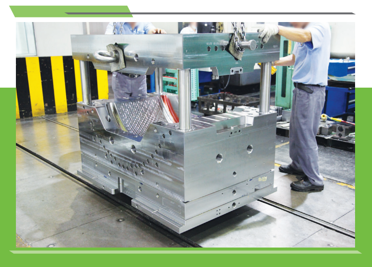
一件大型非標模架正在進行組裝 A large size custom-made mould base is being assembled