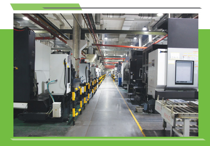
精密加工中心設備 Precision CNC machining facilities