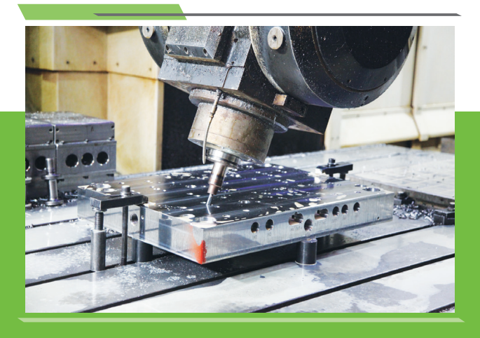
五軸加工中心正為一件模板進行切削形框及精孔加工 The 5-axis machining centre is processing the pocketing and precision holes for a mould plate