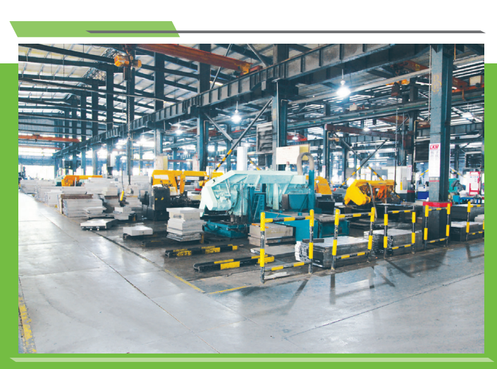
於切割區,鋼材鍛件會被切割成粗形之後才進行加工 At the cutting area, steel blocks are sawed and cut into rough shape before undergoing the rough machining