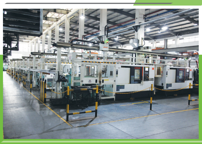
自動化不僅減少了人力,還提高了生產部署的靈活性 Automation not only reduces manpower but also enhances the flexibility of production deployment