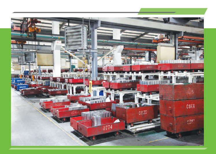
模板儲存倉庫一角 A view of the mould plates warehouse