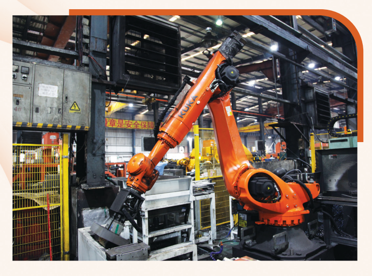
生產線上的機械臂 A robotic arm at the production line