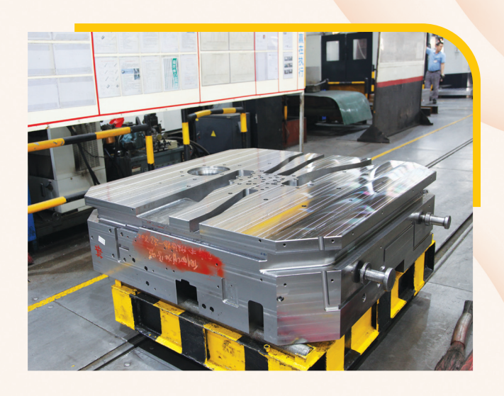
▼大型非標模架部分 Part of a large size custom-made mould base