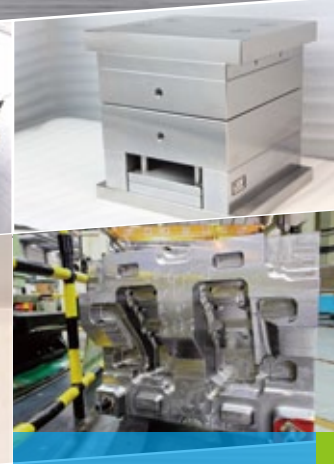
Interim Report 2011