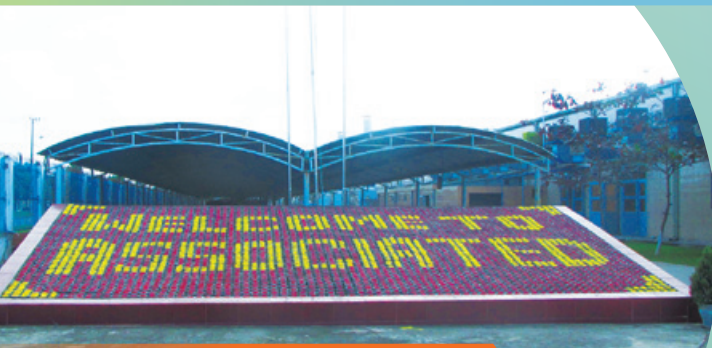
Danang City, Vietnam – Third Plant