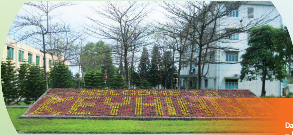
Danang City, Vietnam – First Plant

MATRIX is a well-established manufacturer of plastic, die-cast and plush toys, with vertically integrated production process including mould making, manufacturing and design and a manufacturer of lighting products. Currently, the Group operates five plants – four in Vietnam and one in Zhongshan, the PRC. As at 31st December, 2014, the Group employed approximately 11,600 staff in Hong Kong, Macau, PRC, Vietnam, Australia, Mexico, United States of America and Europe. The Shelcore and the Funrise Group, well-established toy companies in designing, manufacturing and selling plastic toys were merged into the Group since 2005 and 2007 respectively.