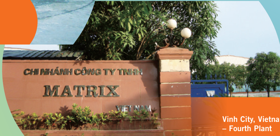
Vinh City, Vietnam – Fourth Plant