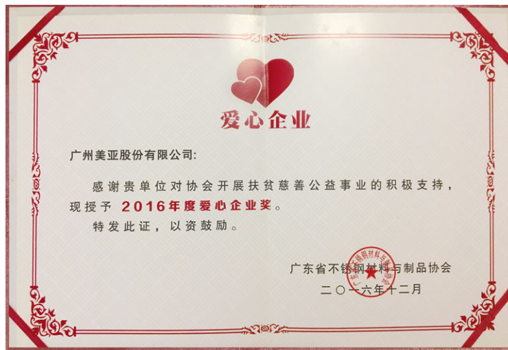
A “Love and Care Enterprise Award” 2016 was granted to Guangzhou Mayer in December 2016

The Group seeks to enhance its social image and sense of social responsibility through community investment, and encourages all of its employees to take the initiatives to help and support local communities and neighborhoods. The Group greatly supports environmental protection activities. By organizing volunteering activities, we seek to enhance employees' environmental awareness and draw more attention of the general public to the importance of environmental protection.