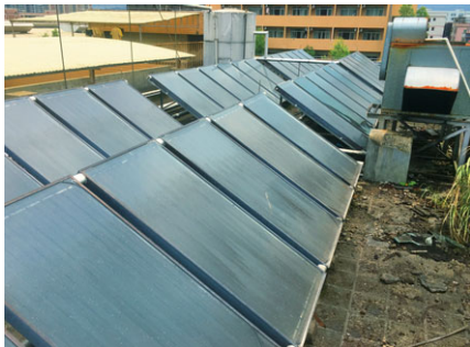
Power generation equipment using solar energy on the rooftop of staff quarters

The Group has obtained the ISO14001 environmental management system certification, which is valid from 29 September 2016 to 28 September 2019