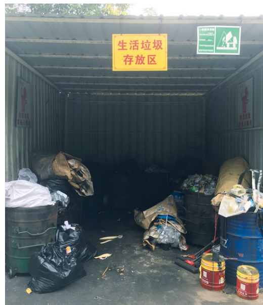
Household trash area in a factory

The Group has formulated and implemented the "Waste Management Procedures". By separating, collecting and treating production and domestic solid wastes, it is ensured that the wastes produced by the Group will not pollute the environment and will comply with the Group's environmental policy as well as local laws and regulations. Hazardous wastes and non-recyclable industrial wastes are passed by the managing department to state-recognized and qualified waste disposal organizations for treatment.