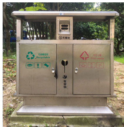
Waste separation facilities with recyclable, non-recyclable and hazardous classifications in factory area

Guangzhou Mayer has obtained an “Emission Permit” issued by Guangzhou Development Zone Construction and Environmental Protection Bureau, which is valid from 2 March 2016 to 1 March 2021. Guangzhou Mayer has installed a sewage treatment system to directly treat the sewage during production.