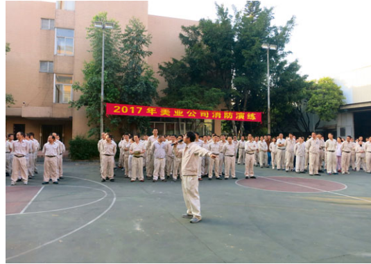
Participation of Guangzhou Mayer's staff members in the annual fire drill on 19 December 2016

Every year, Guangzhou Mayer designs programs for the annual fire-fighting emergency drill, in order to further improve the staff's understanding of fire extinguishers inside the factory and small-scale fire, so that the staff members are able to use the fire extinguishers correctly to extinguish small-scale fire and security guards are able to use the emergency rescue equipment located in the micro-firefighting stations inside the factory correctly.