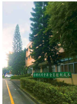
Green environment in production area

The Group's premises have been designed as a green production area, where arbors and shrubs are continuously planted, totaling 315 trees of 13 species including lychee trees, longan trees, mango trees, pine trees and so forth.