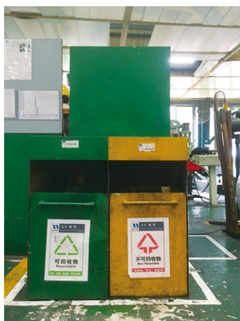
Waste separation facilities separating recyclable and non-recyclable wastes in a production workshop

Waste separation facilities with “Recyclable”, “Non-recyclable” and “Hazardous” classifications are set by Guangzhou Mayer to encourage residents and employees to develop green living habits. Hazardous wastes are collected and treated by a qualified company engaged by the Group.