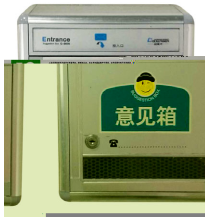
Suggestion box located in the office building

Regarding corruption, fraud or practices harming the interests of the Group. If it is reported or prevented beforehand, and thus prevent the Group from suffering material loss, a top-level merit will be recorded for the employee.