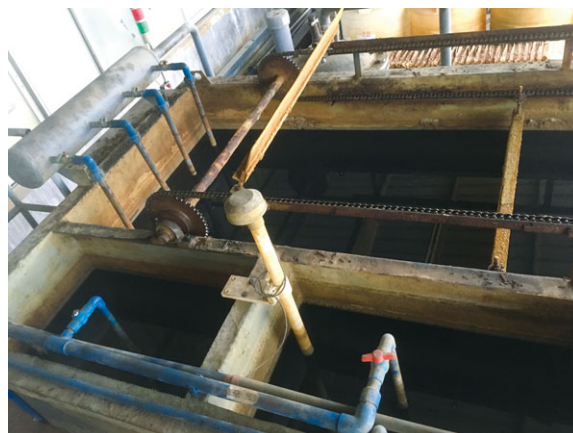
Sewage treatment system

Guangzhou Mayer has obtained an “Emission Permit” issued by Guangzhou Development Zone Construction and Environmental Protection Bureau, which is valid from 2 March 2016 to 1 March 2021. Guangzhou Mayer has installed a sewage treatment system to directly treat the sewage during production.