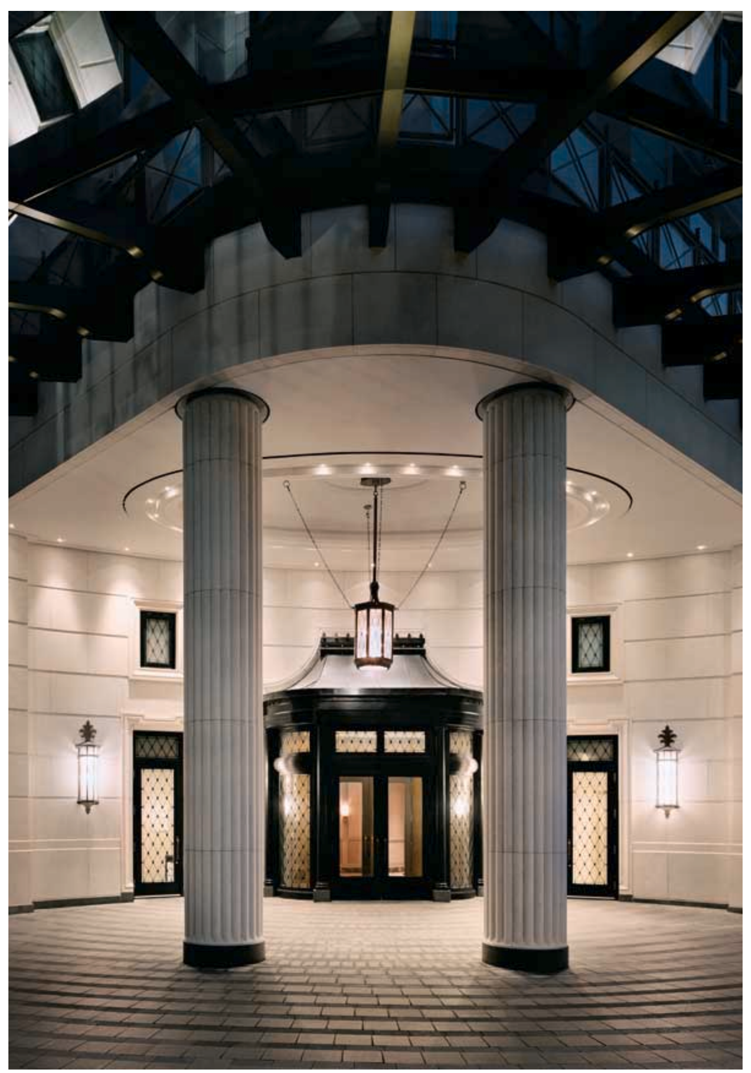
Elegant and refined living at the newly-completed One St. Thomas, Toronto, Canada.