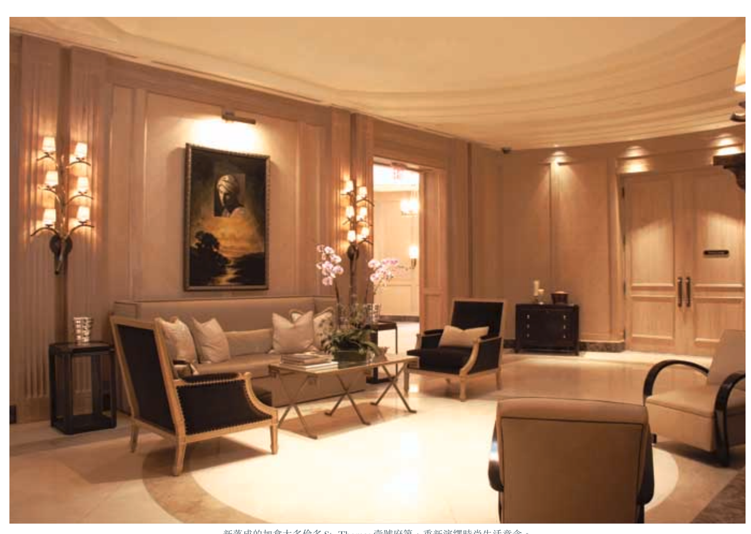
新落成的加拿大多倫多 St. Thomas 壹號府第,重新演繹時尚生活意念。