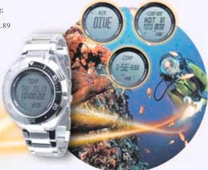
The multi-function digital diving watch is capable of measuring a maximum depth of 200m. Other functions include a digital compass, yacht timer, temperature gauge, chronograph and alarm.

The Group enjoyed satisfactory capital gains for the above disposals.