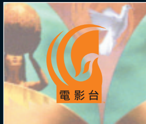
Phoenix Movies Channel 鳳凰衛視電影台 (1998)