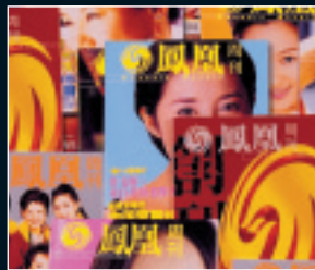
Phoenix Weekly 鳳凰周刊 (2000)