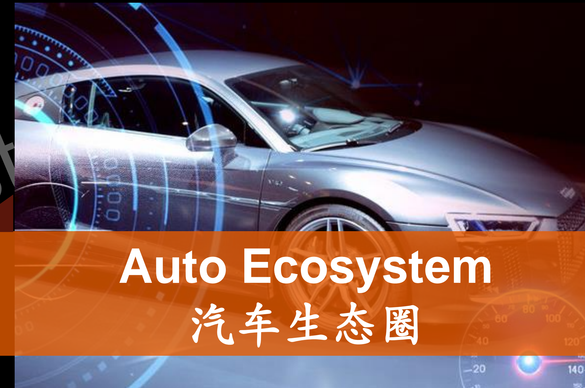
Auto Ecosystem 汽车生态圈