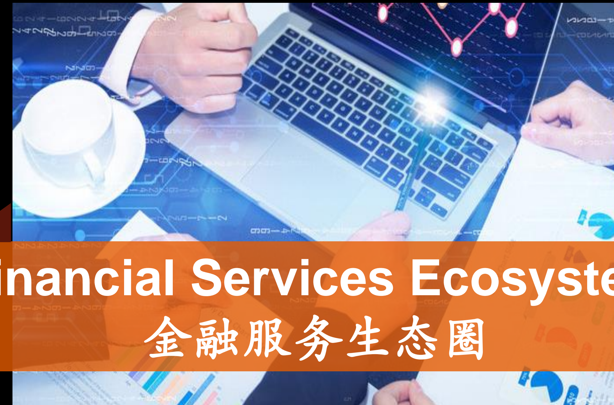
Financial Services Ecosystem 金融服务生态圈