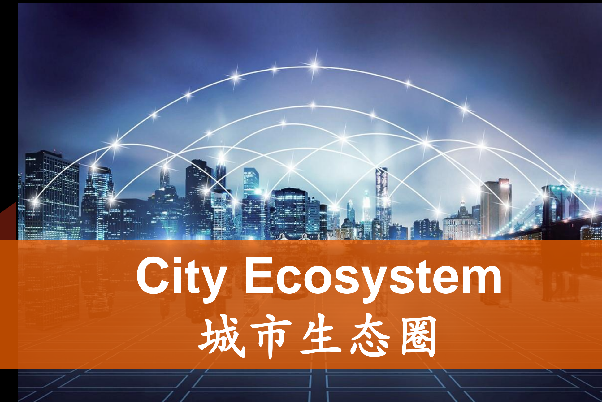
City Ecosystem 城市生态圈