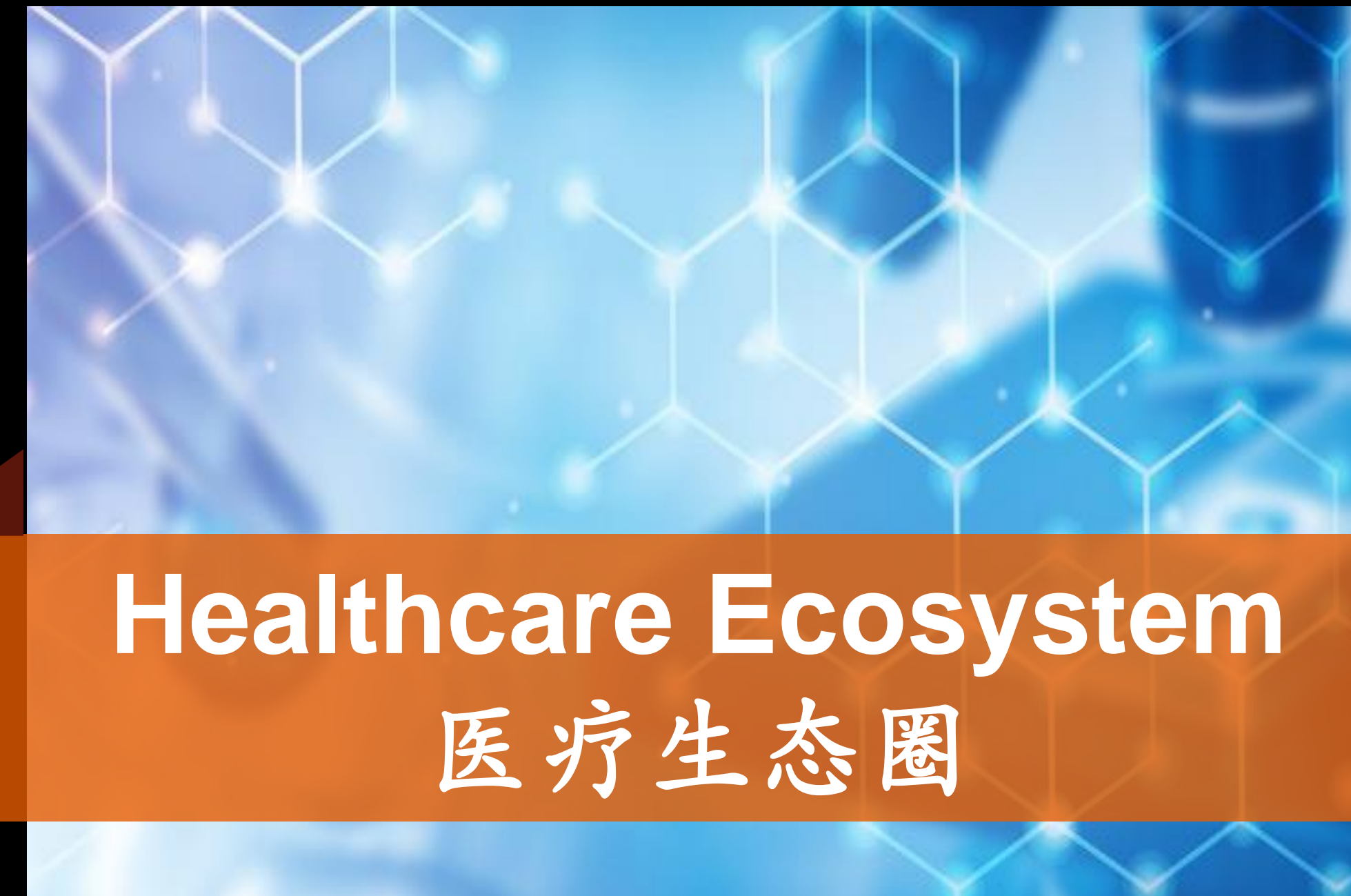
Healthcare Ecosystem 医疗生态圈