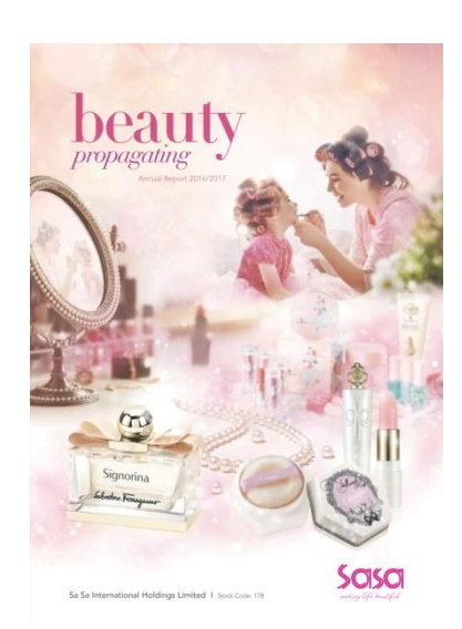
Annual Report 2016/17, with the theme of "Beauty Propagating", won an Honour prize in 2017 International Galaxy Awards.

Organised by independent awards organisation, MerComm, Inc., the annual International ARC Awards are reputed to be "The Oscars" for annual reports, and was judged on criteria in creativity, clarity, effectiveness and excellence in professional communications. With "Be Trendy, Enjoy Life" as its theme, the design of the Group's Annual Report 2015/2016 was rewarded three recognitions in 2017 International ARC Awards, presenting Sa Sa's recent business strategy of E-commerce. The integration of QR code and delicate desserts in the design conveys an idea of quality lifestyle and unprecedented shopping experience brought by E-commerce to our shareholders and customers.