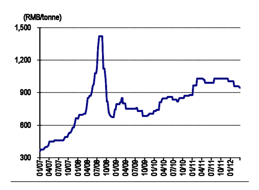
Price of No. 4 raw coking coal, Liulin

The prices for coal products were volatile during 2007 to 2008 as illustrated below. In the circumstances, the transactions entered into at different points of time might have significantly different prices. As such, the allegations in the First Report and the Second Report based on simple mathematical calculation method are biased.