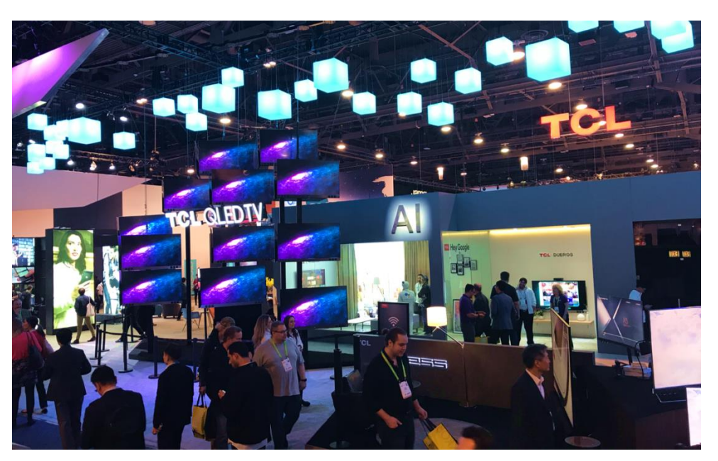
TCL multimedia exhibition booth at CES was positioned prominently. A Quantum Dot technology and an AI experience area were set up.