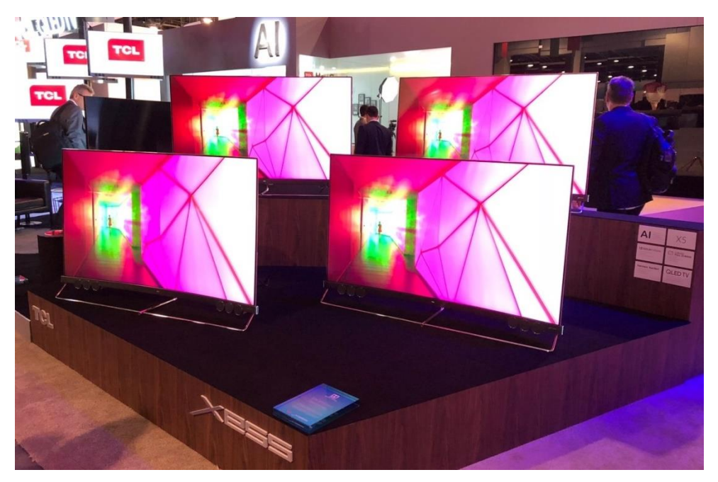
New product X5 of the XESS series