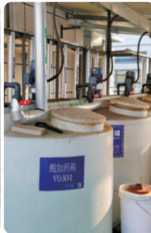
Sewage Treatment Facilities 廢水處理設施