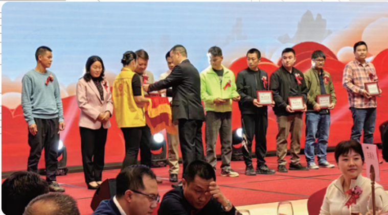
Condolences to Epidemic Prevention Personnel and Fire Brigade Activities

本集團深明責任無處不在，應當對自己負責、對家人負責、對企業負責、對社會負責，重視企業形象與社會責任，並以「以人為本、履行社會責任」的管理方針，積極追求回饋及貢獻社會。本集團向來依法經營納稅，不遺餘力地協助解決當地的就業壓力。本集團為員工好好計劃退休生活作準備，為國內業務員工繳納五險一金，香港業務員工參加強積金計劃。本集團一直保持良好的生產經營、積極推行綠色環保理念及營造良好的發展秩序，在保持社會穩定及建設和諧社區方面，有一定的貢獻。於報告期內，本集團捐贈人民幣8,000給鳳崗敬老院及梅州職業技術學院。本集團於「八一」建軍節慰問消防救援隊伍及捐贈物品。