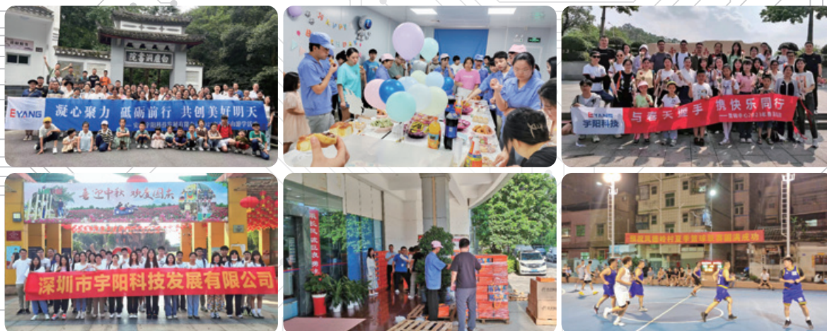
Staff Activities 員工活動與福利

本集團亦非常關注員工的身心健康，為員工組織活動，包括籃球比賽、團建活動、旅遊等，希望增強員工之間的凝聚力、提升員工的歸屬感和減輕員工的工作壓力。本集團還設有工會和員工代表，於每季度進行員工滿意度調查及作出相應的改進，並建立意見反映、投訴和申訴機制。