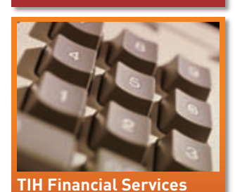
Limited manages and administers the financing functions for the Manhattan Hill project.