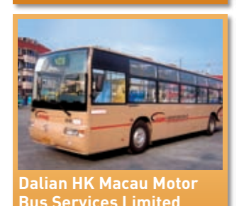
is a Sino-foreign co-operative join venture that operates public bus services in Dalian City.