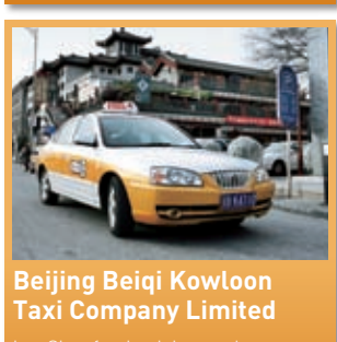
is a Sino-foreign joint stock company that operates taxi hire and car rental services in Beijing.