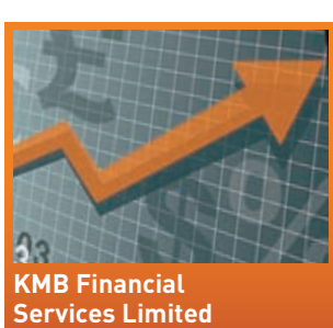
manages and administers the Group's financial resources and