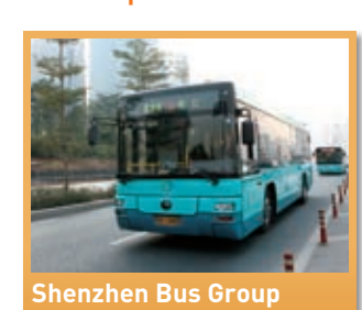
Company Limited is a Sino-foreign joint stock compathat operates public bus and taxi