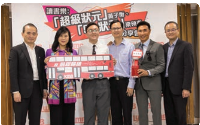
The DSE top scorer was invited to share his learning experience which was broadcast via KMB Facebook