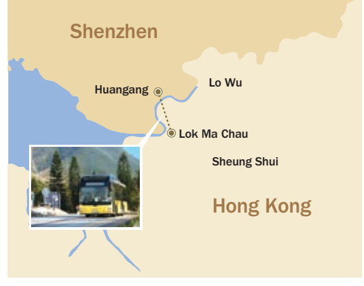
NHKB continues to undertake regular and thorough checks and maintenance to maintain its operational and safety performance at the highest standards

In response to the COVID-19 pandemic, the HKSAR Government has taken measures to reduce people flow and social contacts. The Lok Ma Chau Port has been closed since 4 February 2020. As such, this year saw a decline in the demand for cross-boundary bus service, with patronage plummeting from 3.44 million passenger-trips in 2019 to 0.4 million passenger-trips in 2020.