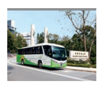
Sun Bus has upgraded vehicle size and designed a flexible timetable to fit in a work-fromhome arrangements

At the end of 2020, the SBH Group had a fleet of 390 buses and continued its fleet upgrade programme by introducing eco-friendly buses and a wider application of technology. In 2021, five Euro VI super-low-floor double-deck buses will be deployed to keep the fleet's average age below six years. These new buses will be equipped with detective safety technology, driver monitoring system, and seat belts on all seats to enhance safety performance. The SBH Group is committed to continuously strengthening all aspects of its management and operations, as well as to building a reputable brand with customers.