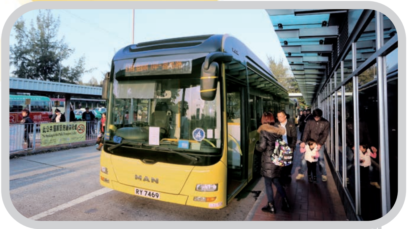
📍 NHKB provides 24-hour cross-boundary shuttle bus services for travellers

The Lok Ma Chau Port has been re-opened since 6 February 2023 when the COVID-19 pandemic started to ebb away. On the same day as the reopening of the port, our Huang Bus was able to resume service simultaneously. This was possible thanks to regular checks and assessments on our fleet and facilities, maintaining our operational and safety performance throughout the service suspension period.