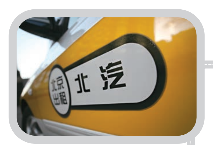
♠ BBKT owns over 3,500 taxis and it is the first Sino-foreign joint stock company to enter the taxi hire and car rental sector in Mainland China

BBF has more than 1,000 vehicles available for charter, mainly serving Beijing (北京) and Tianjin (天津). Being ISO9001:2008 certified for its Quality Management Systems in the provision of car rental services, BBF is well placed to take advantage of the business opportunities afforded by business commuters as well as by the wide variety of events, conferences and exhibitions held in the capital.