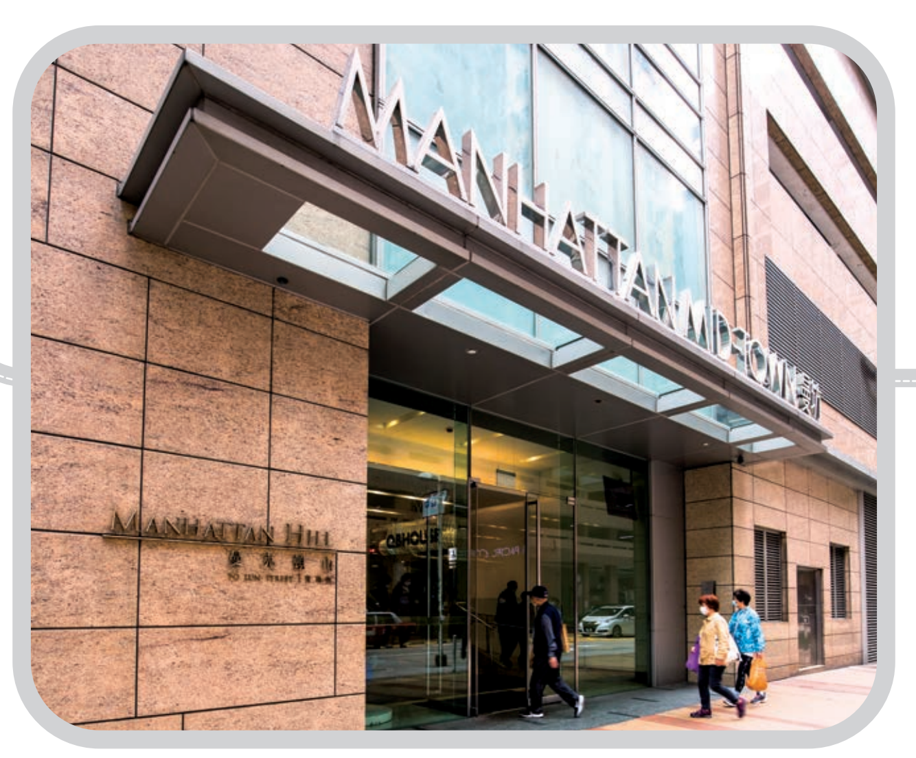
(A) The Manhattan Mid-town shopping mall, a high-end podium mall located in Lai Chi Kok, has fully leased out the entire lettable area, providing a recurring rental income for the Group