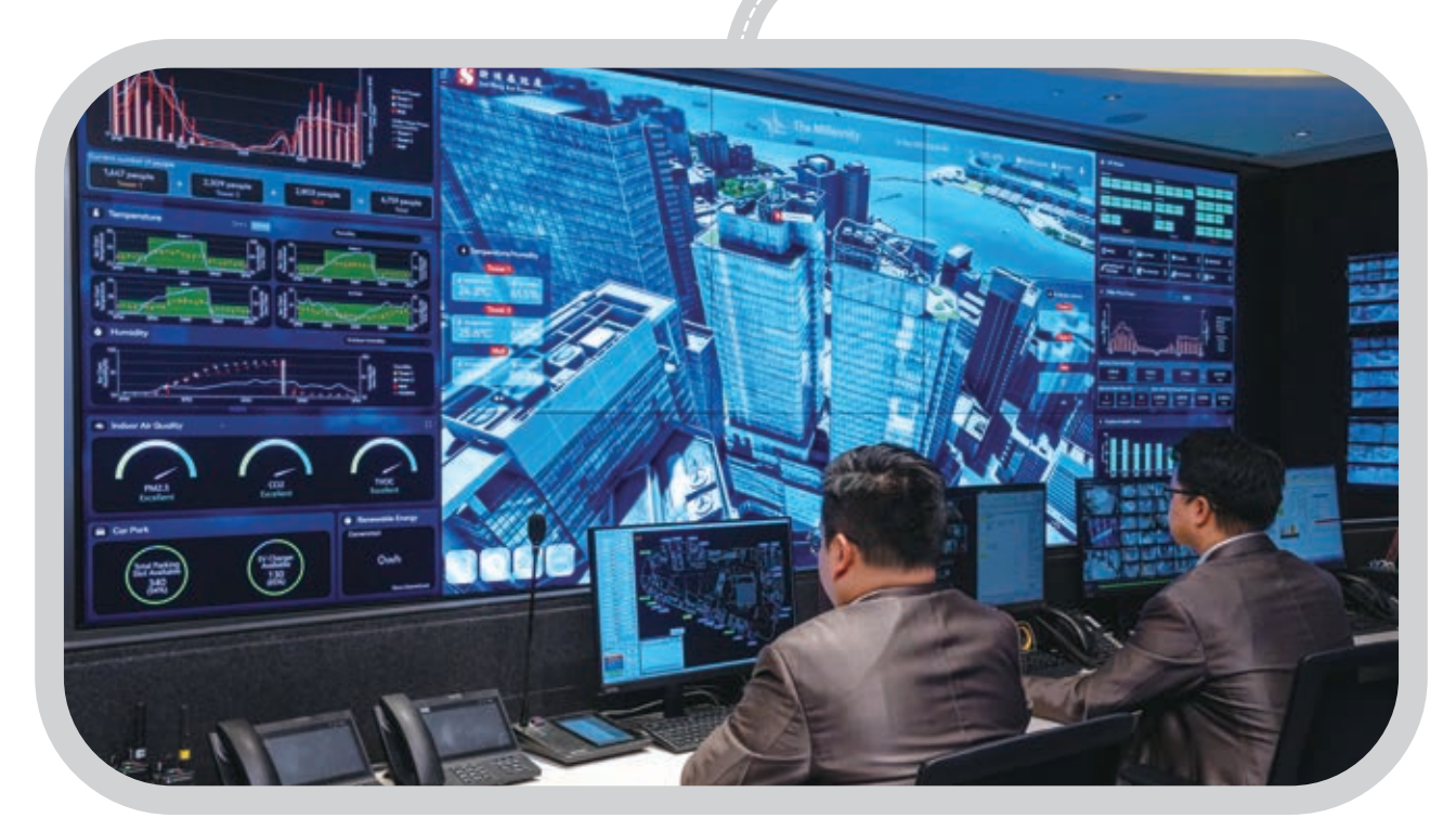
(2) The Millennity has adopted a Building Information Modeling and a high-precision 3D geometric model system to digitalise property information