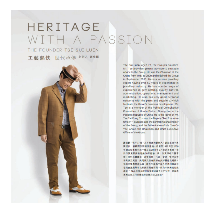
- End -