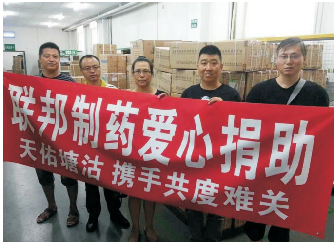
Donation to Tianjin disaster-stricken area in 2015

For over 20 years from the early days of the Group to 2010, we have donated money and supplies amounting to RMB28 million to the people suffering from serious disasters, such as SARS, the earthquake in Wenchuan and Yushu in Qinghai province. In 2008, we donated RMB12 million to build a United Laboratories Hospital in the eastern earthquake-stricken area of Sichuan, in addition to the medical and supporting equipment including X-ray machines, multi-function anesthetic machine, fully-automatic biochemical analyzer and ambulances worth RMB1.2 million, with an aim to better cater for the needs of the hospital. In 2012, the Group donated RMB1.8 million to help Bayan Nur, Inner Mongolia with flood relief and reconstruction. In 2013, the Group donated medicine worth RMB1 million to the earthquake-stricken area in Ya'an, Sichuan in support of the disaster relief efforts.