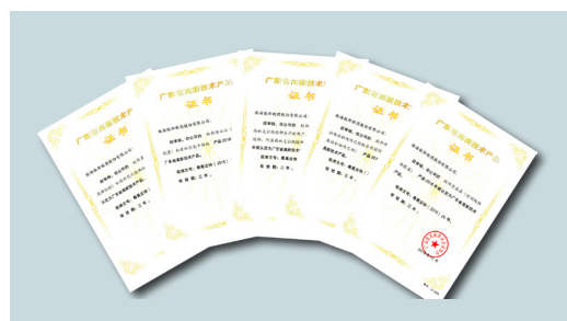
Certificates of high-tech products of Guangdong Province

We explore the market under the brand of The United Laboratories and secure it with quality. We carry out our production and management in strict compliance with the GMP standards. We have established a complete quality assurance system and after-sales service system, and we are the first pharmaceutical company in China that passed GMP certification. In addition, we have many bulk medicine products which have obtained certification of EU CEP and USFDA as well as the authorities of Japan and Russia. The Group cooperates with the first-class domestic pharmaceutical distributors, with our own sales and service team, to ensure perfect delivery and after-sales service.