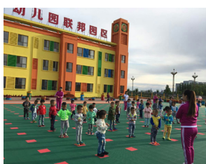
The United Laboratories Kindergarten

The subordinate units of the Group has in succession set up cultural groups and to organize various activities, seminars and rites of enhancement on a regular basis to help our employees participate and experience the corporate culture. In addition, the Group set up special prize of "Chun Miao Award", "Loyalty Award" and other awards to honor new employees and the outstanding employees. The Group has set up in-house publications since 1997, namely The TUL's People and Pictorials, and registered the corporate blog and wechat official account. Such publications provide a valuable platform to promptly follow news and trends of the enterprise, and enhanced our cohesion in a considerable manner.