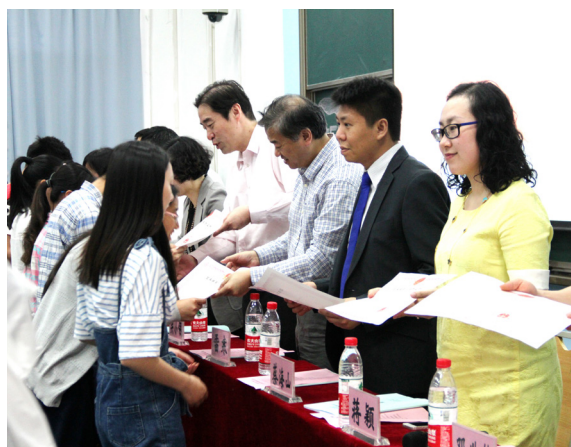
Scholarship award ceremony

The United Laboratories always concern and support to the development of Chinese medical education. Since 1998, the Group has donated a total of RMB46 million and set up dedicated "The United Laboratories Education Scholarship" in 38 medical and pharmaceutical universities all over China, benefiting 48,000 students in more than 50 colleges and universities, including China Medical University, Capital Medical University, China Pharmaceutical University, Shenyang Pharmaceutical University, Chongqing Medical University, Tongji Medical College. The Group held "The United Laboratories Education Scholarship" ceremonies in Chongqing Medical University and Fujian Medical University and donated RMB220,000 which benefiting 110 students. We will continue to champion the cause of medical education and support the training of medical personnel in the future.