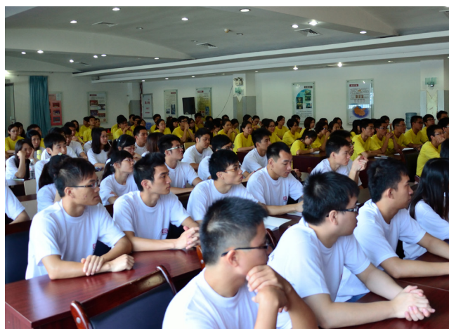
New employee introduction training

Staff training and education is key to maintain an energetic enterprise. The United Laboratories considers staff training a constant propeller for the enterprise to improve efficiency and thus provides induction training and a variety of training opportunities for each staff. The Group has included the professional training, team training GMP training and management training into our daily training plan, and in accordance with the training needs of each functional department, the Group formulates annual training program to continually enhance our staff's professional standard. Drug safety concerns the life and health of the public, therefore, The United Laboratories aims to produce the best quality products, foster deeper understanding of each management standard for our staff, prudently handle each step of the drug manufacturing process and ensure the quality and safety of our product.