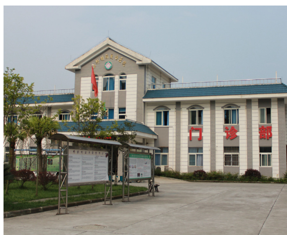
The United Laboratories Hospital in Sichuan Province

For over 20 years from the early days of the Group to 2010, we have donated money and supplies amounting to RMB28 million to the people suffering from serious disasters, such as SARS, the earthquake in Wenchuan and Yushu in Qinghai province. In 2008, we donated RMB12 million to build a United Laboratories Hospital in the eastern earthquake-stricken area of Sichuan, in addition to the medical and supporting equipment including X-ray machines, multi-function anesthetic machine, fully-automatic biochemical analyzer and ambulances worth RMB1.2 million, with an aim to better cater for the needs of the hospital. In 2012, the Group donated RMB1.8 million to help Bayan Nur, Inner Mongolia with flood relief and reconstruction. In 2013, the Group donated medicine worth RMB1 million to the earthquake-stricken area in Ya'an, Sichuan in support of the disaster relief efforts. In 2015, the Group donated the carbapenems drug worth RMB506,000 for the treatment of respiratory tract and skin tissue infection to