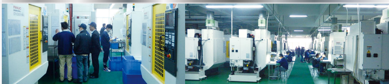
Production facilities at the factory at Dongfeng Village, Huzhen, PRC.

Sales of costume jewellery for the year recorded a decline of 31.8% to HK$80,548,000 (2017: HK$118,023,000).