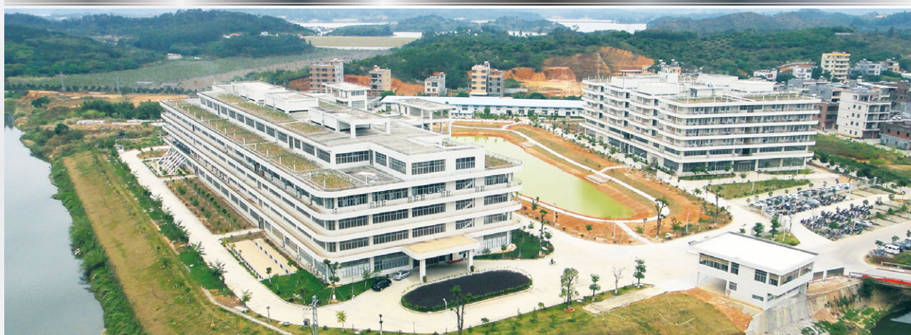
The factory and dormitory buildings at Dongfeng Village, Huzhen, PRC.