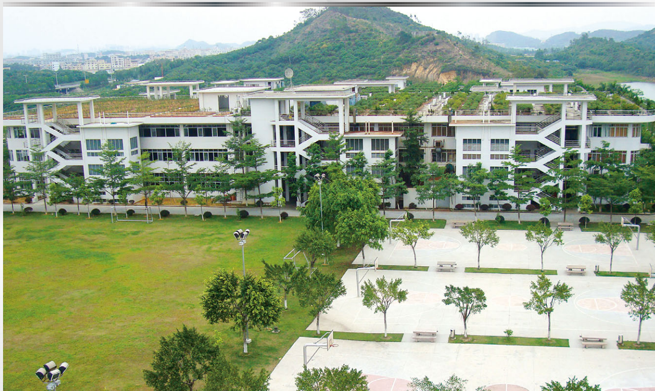
The Dongguan Dalang factory