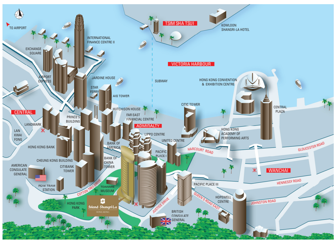
X MTR STATION