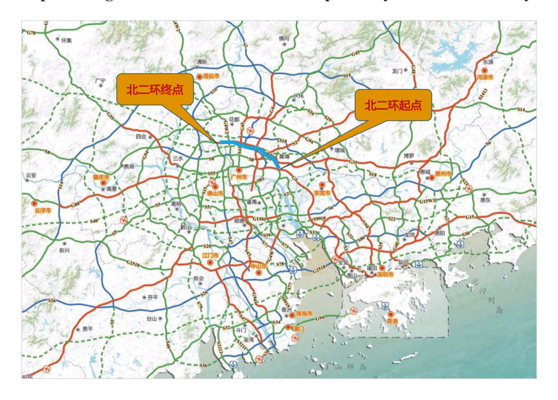
The map showing the location of the GNSR Expressway in the Greater Bay Area

The GNSR Expressway, also known as the Huocun to Longshan section of the Shenyang-Haikou Expressway, is situated at the north of the Guangzhou city centre and runs through Baiyun District and Huangpu District of Guangzhou. It forms part of the Shenyang-Haikou Expressway (G15) and Beijing-Hong Kong and Macau Expressway (G4), as well as a key component of Guangzhou Ring Expressway (G1508). The GNSR Expressway commenced construction in November 1998 and opened for traffic in January 2002. Other than the Huocun to Luogang section which is a two-way, eight-lane expressway as a result of the expansion as part of the construction of the Xiangxue Interchange in 2019, the GNSR Expressway is a two-way, six-lane expressway with a total toll length of approximately 42.5km and a design speed of 80km/h. The toll period of the GNSR Expressway is currently scheduled to expire in January 2032. For illustrative purposes only, maps showing the location of the GNSR Expressway are set out below: