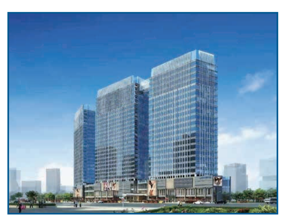
Conceptual Drawing of the GZ Project upon Completion (designed in 2020) 廣州項目竣工概念圖(2020年設計)