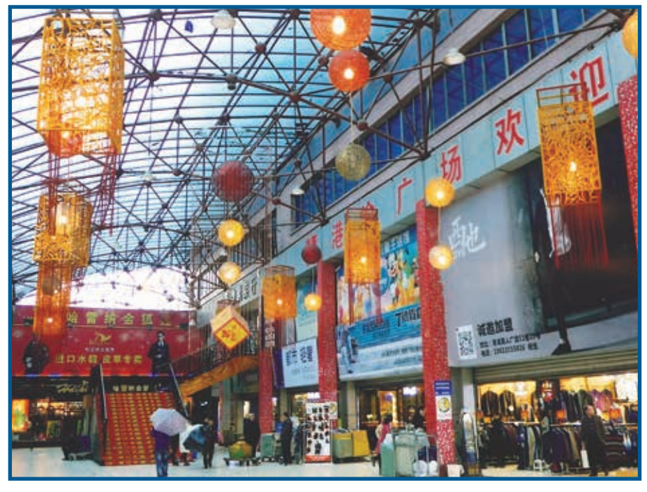
Entrance at 8/F, Guang Yu Square 港渝廣場八樓入口