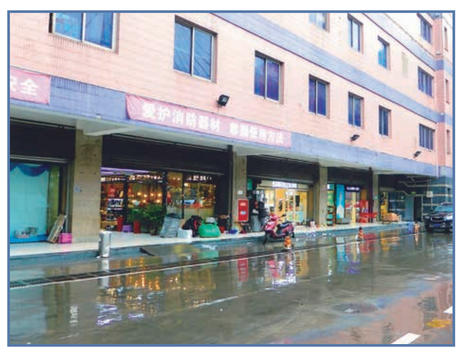
Entrance at G/F, Guang Yu Square 港渝廣場地下入口