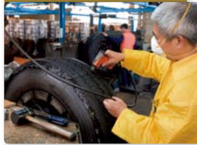
Tyre retreading was introduced