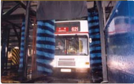
Our bus-washing machines were equipped with water recycling systems