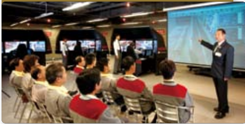
KMB introduced Hong Kong's first Driving Simulator Studio to enhance the training of bus captains