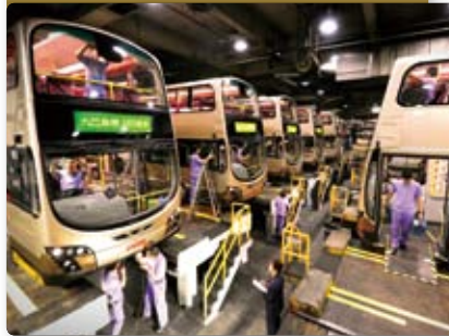
The four main operating depots of KMB at Lai Chi Kok, Sha Tin, Kowloon Bay and Tuen Mun were certified by the Q-Mark Council of the Federation of Hong Kong Industries as having met the Green Mark Standard under the Hong Kong Green Mark Certification Scheme