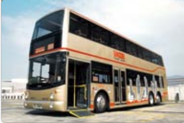
KMB introduced the world's first super-low floor double-deck bus with wheelchair access