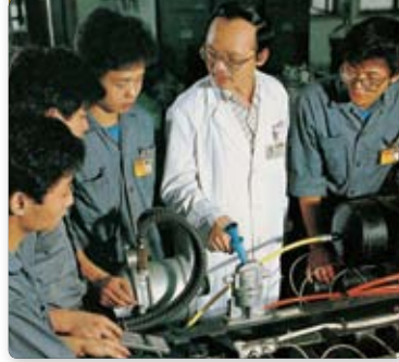
KMB's Technical Training School was established