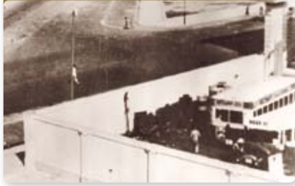
KMB's first depot opened at the north end of Nathan Road