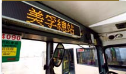
KMB launched the on-board electronic Bus Stop Announcement System