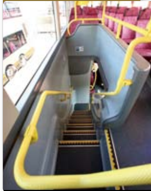
KMB introduced a new generation of buses with the straight staircase design