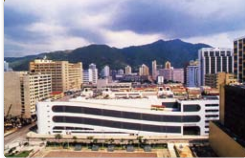
KMB's Overhaul Centre, listed in the Guinness Book of World Records as the largest multi-storey bus depot in the world, became operational