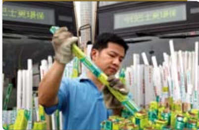
KMB became the first enterprise in Hong Kong to participate in the fluorescent tube recycling campaign