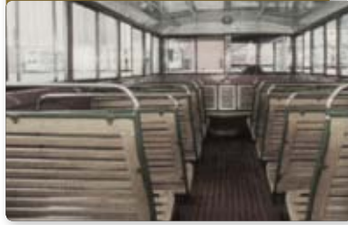
An early bus interior with wooden slatted seats