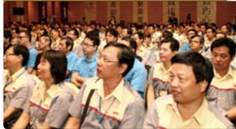
A large-scale training programme "Service from the Heart" was organised for more than 10,000 operations and maintenance staff