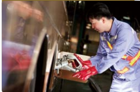
KMB adopted Near Zero Sulphur Diesel