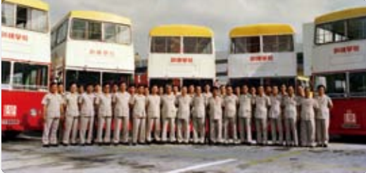
KMB's Bus Captain Training School was established in Sha Tin