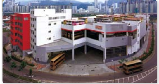
KMB's new environment-friendly depot in Lai Chi Kok was completed