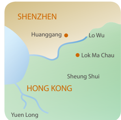
● NHKB's bus termini

Notwithstanding the decline in patronage, the demand for cross-boundary bus services is expected to grow in line with the stronger social and economic ties between Hong Kong and China Mainland, and the likely growth in visitor numbers as residents from more major Mainland cities become eligible for the Individual Visit Scheme. NHKB