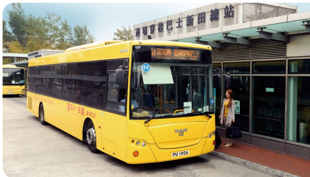
NHKB's shuttle bus services are well received by cross-boundary travellers and commuters

To enhance passenger comfort and convenience, NHKB's terminus at San Tin is equipped with four comfortable air-conditioned waiting lounges and an integrated information display system.