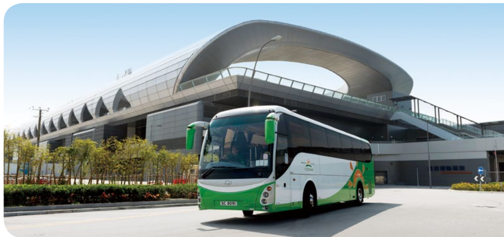
SBL provides premium, value-for-money services to a wide range of customers

SBL's ISO 9001:2008 certification is a ringing endorsement of its quality management systems.