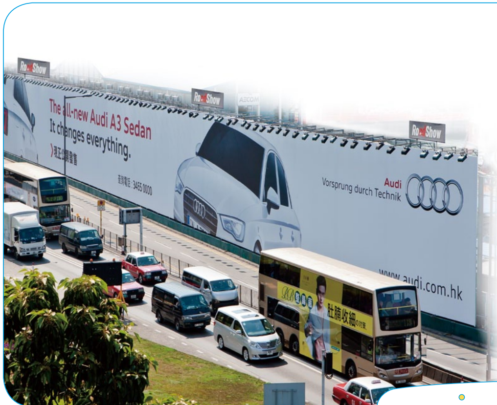
RoadShow's billboard at the entrance to the Cross-Harbour Tunnel is a powerful advertising platform

RoadShow provides marketing and advertising professionals with a wide range of innovative ways of spreading their messages effectively to their audiences.