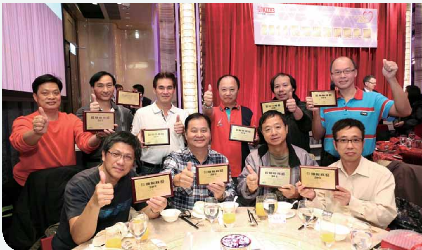
Loyal staff are rewarded via the long service award scheme

Various inter-depot competitions were organised in 2014 to foster team spirit among staff. Competitions were held across a number of disciplines, including badminton, football, basketball, long distance running and photography.