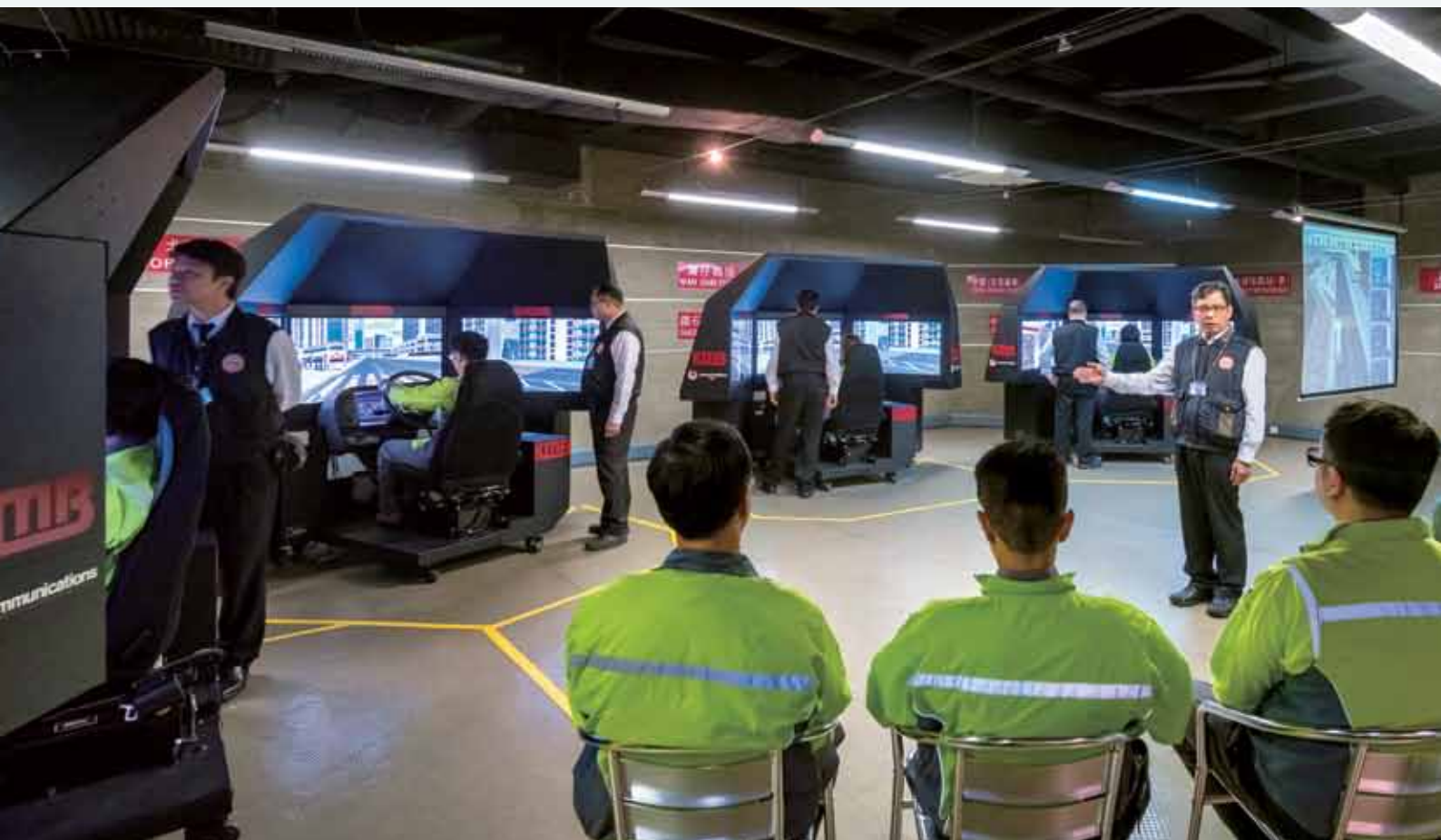
Comprehensive training is provided to our professional bus captains

The Training School's state-of-the-art Driving Simulator Studio recreates real-world environments so that bus captains can improve their driving skills and sharpen their responses to different traffic scenarios. The simulator is environment-friendly as it does not take up road space or consume fuel. The Training School's four simulator stations comprise a driving cabin equipped with driving seat,