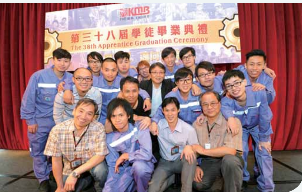
KMB's apprentice training ensures a supply of qualified maintenance workers

KMB and LWB use a systematic performance assessment mechanism to monitor the performance of bus captains and ensure that services are maintained at the highest level.