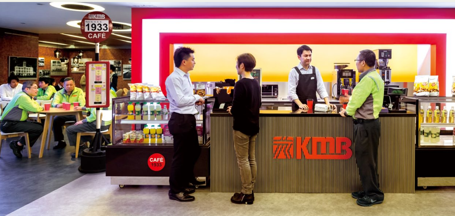
Rest and refreshment areas invigorate the working day