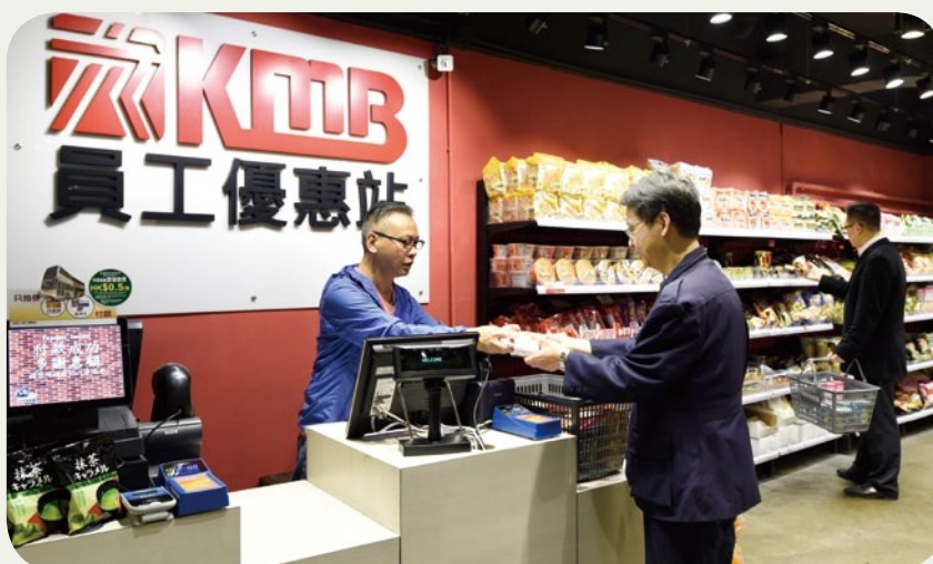
Staff discount shops prove very popular with staff