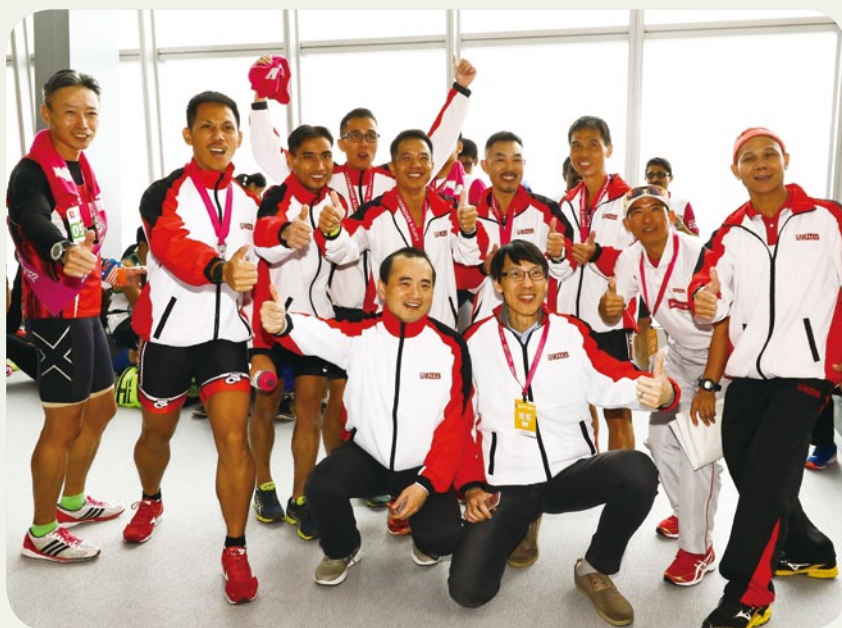
KMB's relay team took on the challenge of the SHKP Vertical Run for Charity – Race to Hong Kong ICC

20-year award and a plaque and a pin, and 113 employees with 10 years' service received a certificate of appreciation.