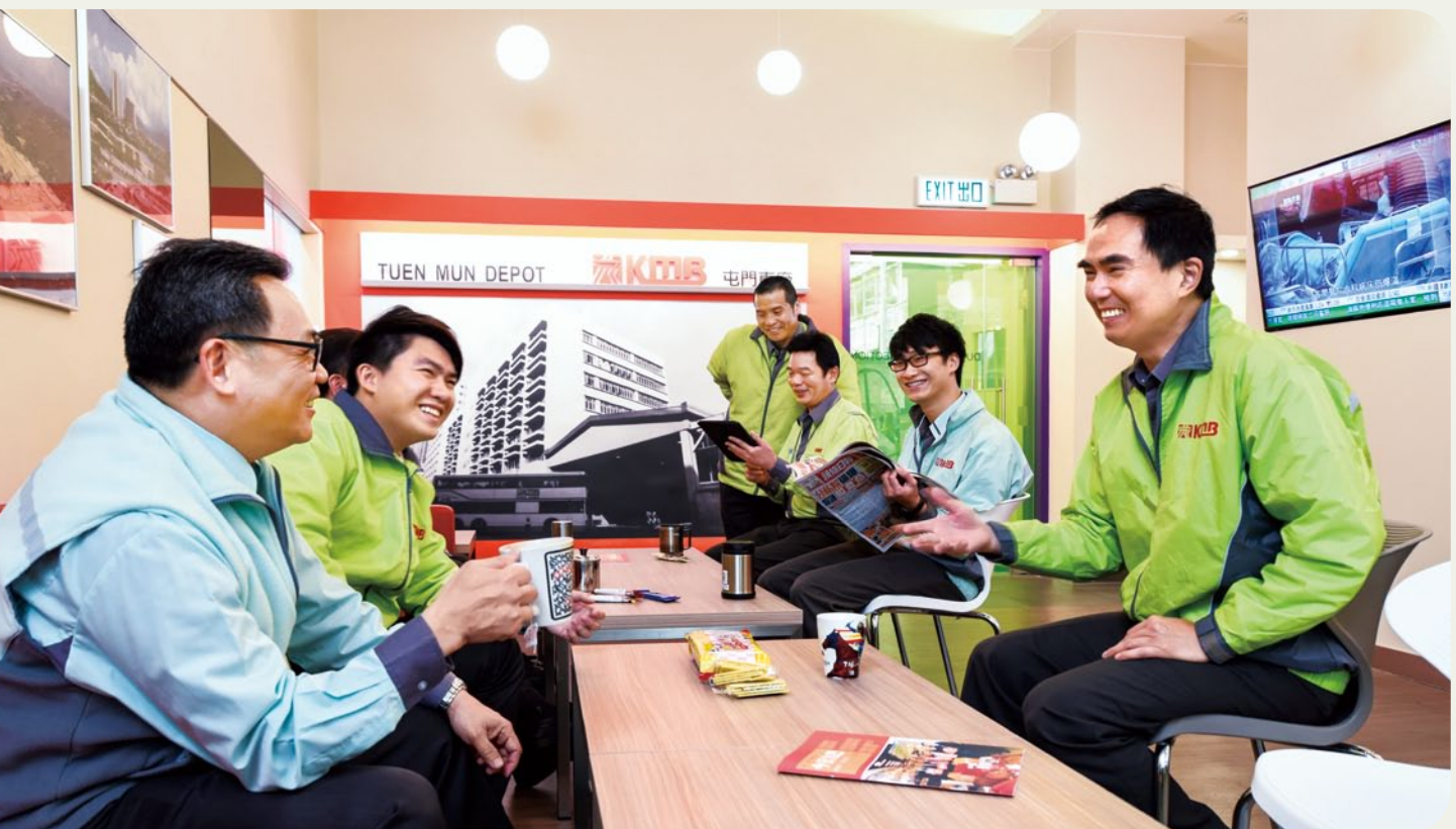
Refurbished rest areas offer our frontline staff a well-earned break

In 2015, the Long Service Award Presentation Ceremony was held once again to recognise the loyal service of our long service staff. 252 employees received the 35-year award and a gold medal, 164 employees received the 30-year award and a plaque and a pin, 355 employees received the