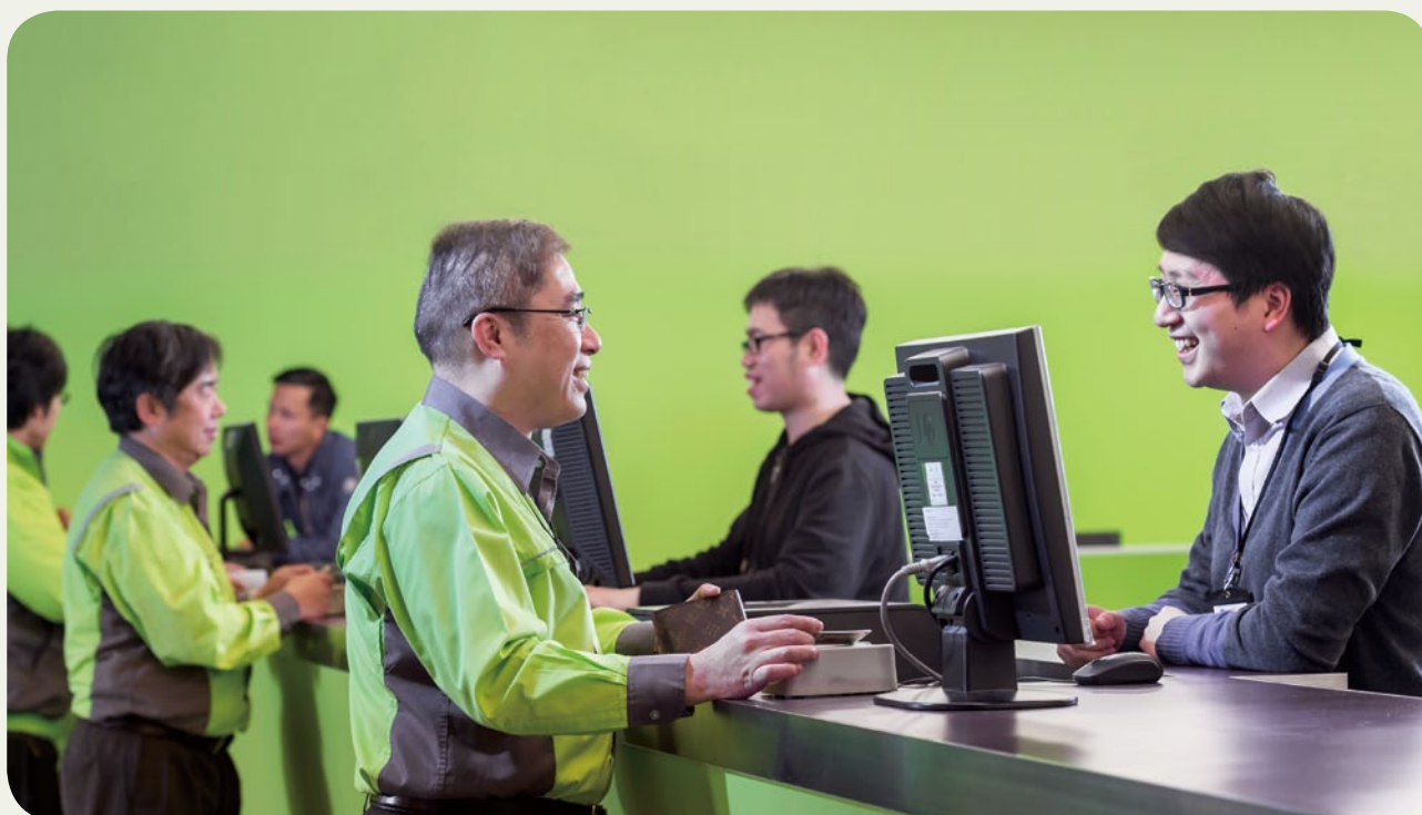
An improved working environment makes for happier staff